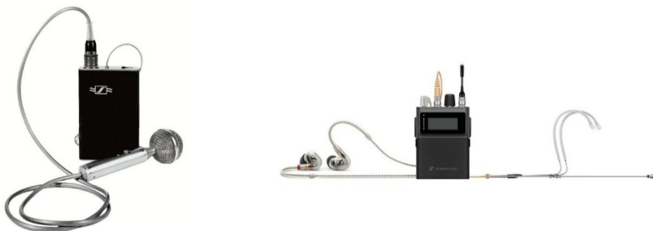
From past to present: Sennheiser mikroport transmitter from the 1950s and today’s Spectera bidirectional SEK bodypack

Celebrating the company’s 80th anniversary, the Sennheiser showcase plays with the fascinating contrast between historical images from Sennheiser’s rich broadcast past and the latest advances in audio technology, including the wideband Spectera wireless ecosystem and narrowband EW-DX systems.