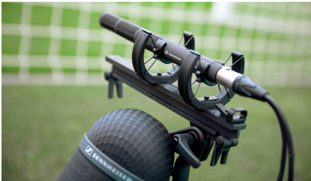
The Sennheiser MKH 8018 stereo shotgun microphone with three selectable stereo modes

Following on from the Sennheiser MKH 8030 figure-of-eight microphone, broadcasters and filmmakers can now discover the latest addition to Sennheiser's MKH series of RF condenser microphones, the MKH 8018 stereo shotgun microphone. Providing flexibility for audio engineers, the climate-proof, rugged shotgun microphone features three switchable stereo modes: MS stereo, for step-free adjustment of spatial imaging, and wide or narrow XY stereo, which are premixed in the MKH 8018 with settings that were fine-tuned and verified in multiple user field tests. An integrated -10dB pad, broadcast-friendly frequency response of 40 – 20,000 Hz, and a compact, lightweight aluminium housing round off this exceptional pro microphone.