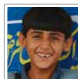
Basit, a boy in Pakistan

"I'm very happy that I'm back at school."