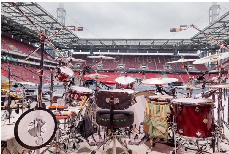
Bertram Engel’s drum kit

Bertram Engel, also well-known as the drummer for Udo Lindenberg, once again relied on microphones from the Sennheiser portfolio during Peter Maffay’s Farewell Tour. The drummer legend performed with two kick drums: the 28” model was miked with an e 902, an MD 421 and an e 901 condenser boundary plate microphone, while the 24” version only had a Sennheiser e 902 and an e 901.