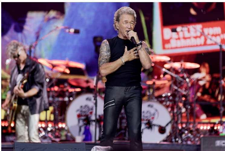
Peter Maffay using an SKM 6000 handheld transmitter fitted with an MM 435 microphone capsule

Latency, which is a factor inherent in all digital systems, is low at 1.9 milliseconds in EW-DX and is not perceivable in practical use. In EW-DX systems, the innovative “Sennheiser Performance Audio Codec” (SePAC) ensures excellent audio transparency from the capsule input to the signal output. The high dynamic range (134 dB) of the transmitters, which are equipped with stacked A/D converters, allows them to be operated without the need to manually set the gain, which can be very helpful when local conditions continually change during long tours.