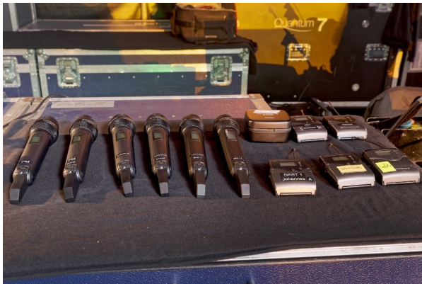
SKM 6000 handheld transmitters ready to go

antennas with circular polarisation were used as antennas for the IEM systems, and these were installed together with an oversized dummy carrot that stage designer Michael Haufe had created some years ago for a Tabaluga tour. At that time, the “carrot microphone” concealed a Sennheiser SKM 2000 handheld transmitter.