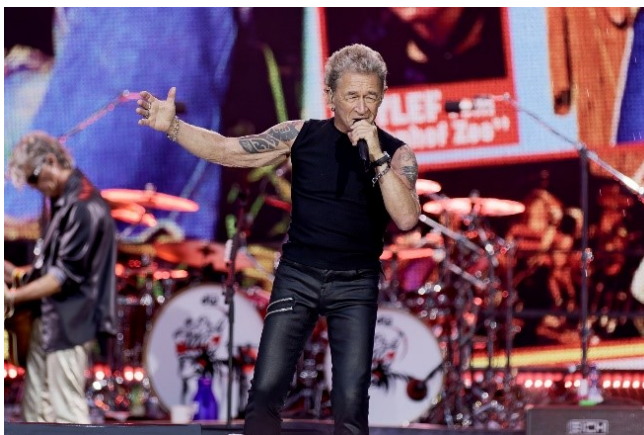
Peter Maffay on his "We love Rock'n'Roll" Farewell Tour

Wedemark, October 2024 – With the "We love Rock'n'Roll" Farewell Tour, Peter Maffay and his band filled Germany's biggest open-air arenas in the summer of 2024. Digital and analogue Sennheiser wireless systems ensured excellent sound during the performances. In addition to Sennheiser Digital 6000 systems and other proven wireless solutions, the new Sennheiser EW-DX series was also used for the shows, including the brand-new EW-DX EM 4 DANTE four-channel receiver.