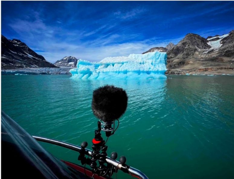
Recording icebergs from a boat

mad at myself for shouting, I checked the recording to find something truly fascinating. Because sound travels four to five times faster in water than air, what I heard in my headphones was the iceberg breaking in half, at some distance underwater. It came through the headphones first because it was moving so much faster underwater. The above water boom, travelling more slowly through the air, arrived slightly after my yell, which was fabulous as it meant I hadn't destroyed the recording with my audible reaction. Hearing the difference in the speed of sound in air versus the speed of sound in the water was amazing!"