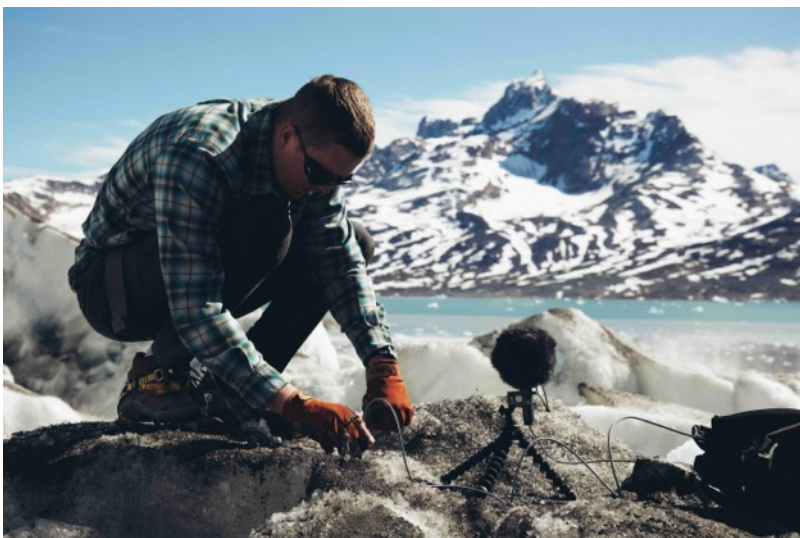
Setting up an MKH 8020 and a recorder on a glacier

https://soundcloud.com/trexbeverly/greenland-underwater-icebergs