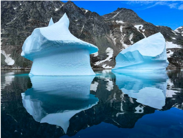
Icebergs are part of the lifecycle of glaciers

According to Beverly, icebergs are part of the lifecycle of glaciers, so recording them both over and under the water was part of the Greenland expedition of recording the wonderful sonic world of glaciers.