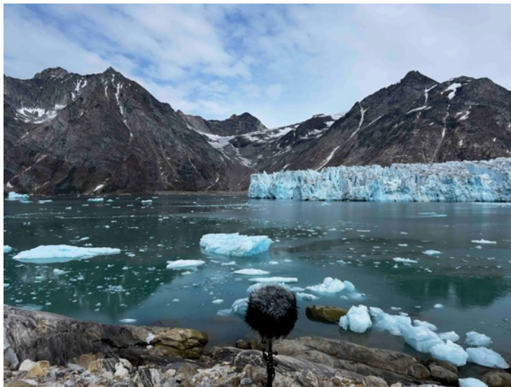
The Sennheiser double-mid-side rig captured the calving sound from a distance

“By using Sennheiser MKH 8020s together with Geofones, I was able to get the sounds of the glacier plus the kind of sub-bass impact coming from the contact mics. And when you mix those together, you get these epic sounding events. And so that was one of my main goals, to have the close calving sound on the glacier and distant perspectives from the Sennheiser double mid side rig, where you’re looking at the glacier from anywhere between a quarter to half a kilometre away.”