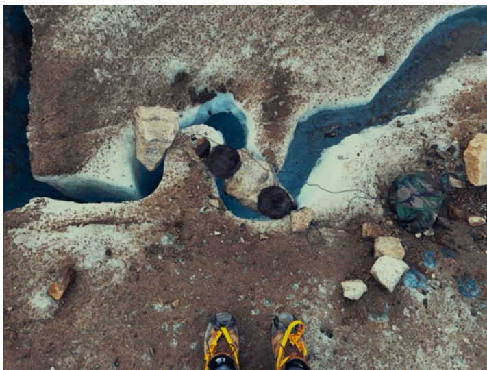
Recording audio in a crevasse

“We captured natural icefalls by leaving drop rigs hanging in resonant crevasses for over 24 hours. This usually meant hanging the microphones over the edge by their cables and leaving the recorder in a dry bag on the edge, normally weighed down by a rock or clipped to an ice screw,” he says.