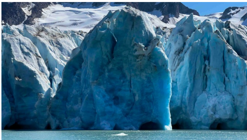
The Knud Rasmussen Glacier