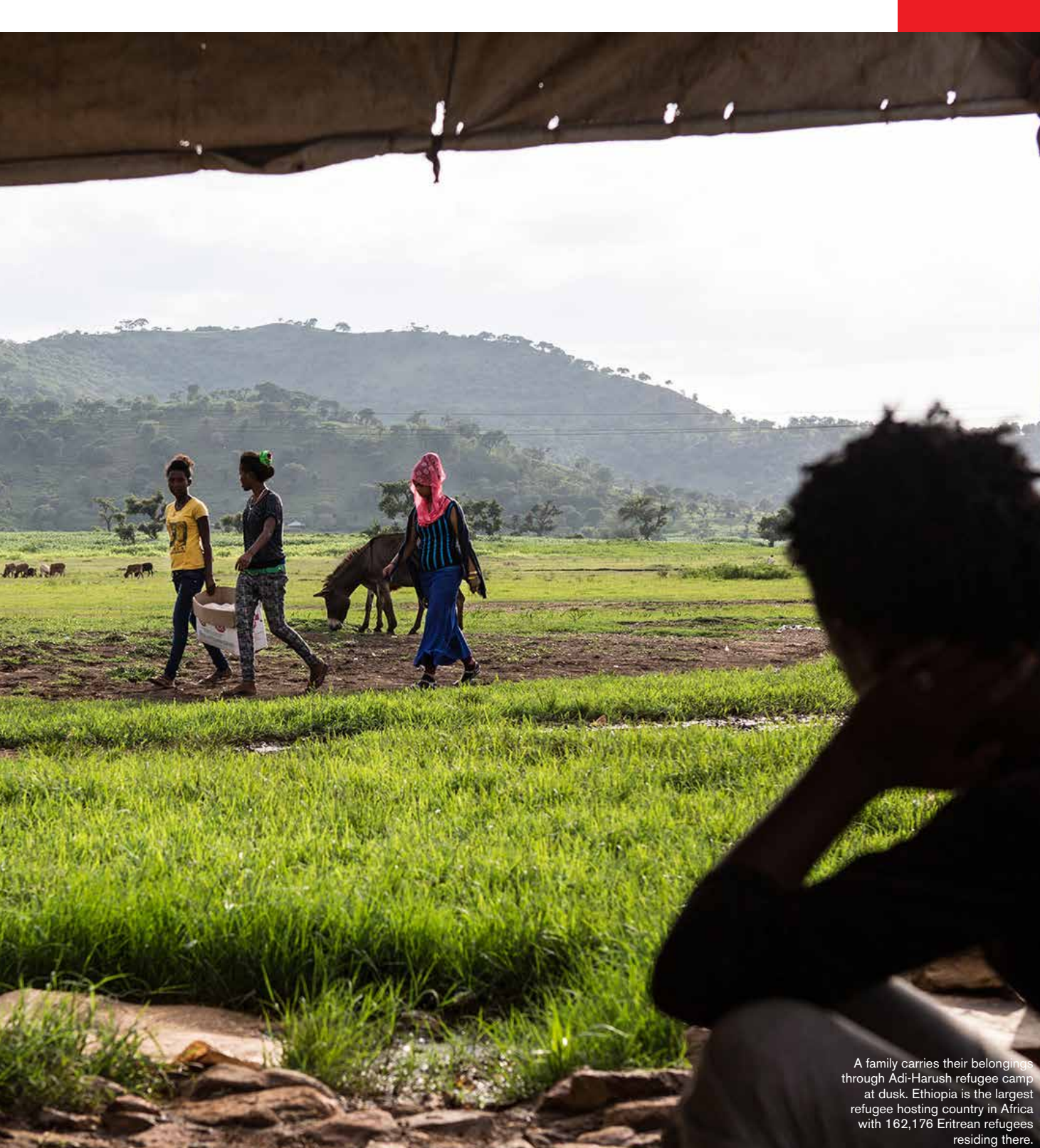
A family carries their belongings through Adi-Harush refugee camp at dusk. Ethiopia is the largest refugee hosting country in Africa with 162,176 Eritrean refugees residing there.

lack of safe and legal routes by which to travel, has resulted in a flourishing market for people smugglers. Smugglers take refugees to the Ethiopian border by car or guide them by foot for a lower price. In an attempt to protect themselves from kidnapping en route to Sudan, Libya and Europe, people try to secure their safety by collecting information in advance from friends and family about the routes, smugglers and dangers. But these efforts are often futile; people desperate for better futures make easy targets for trafficking networks in Ethiopia and beyond. According to Unicef, unaccompanied children are particularly vulnerable and often fall victim to abuse and human trafficking as they head north. 27