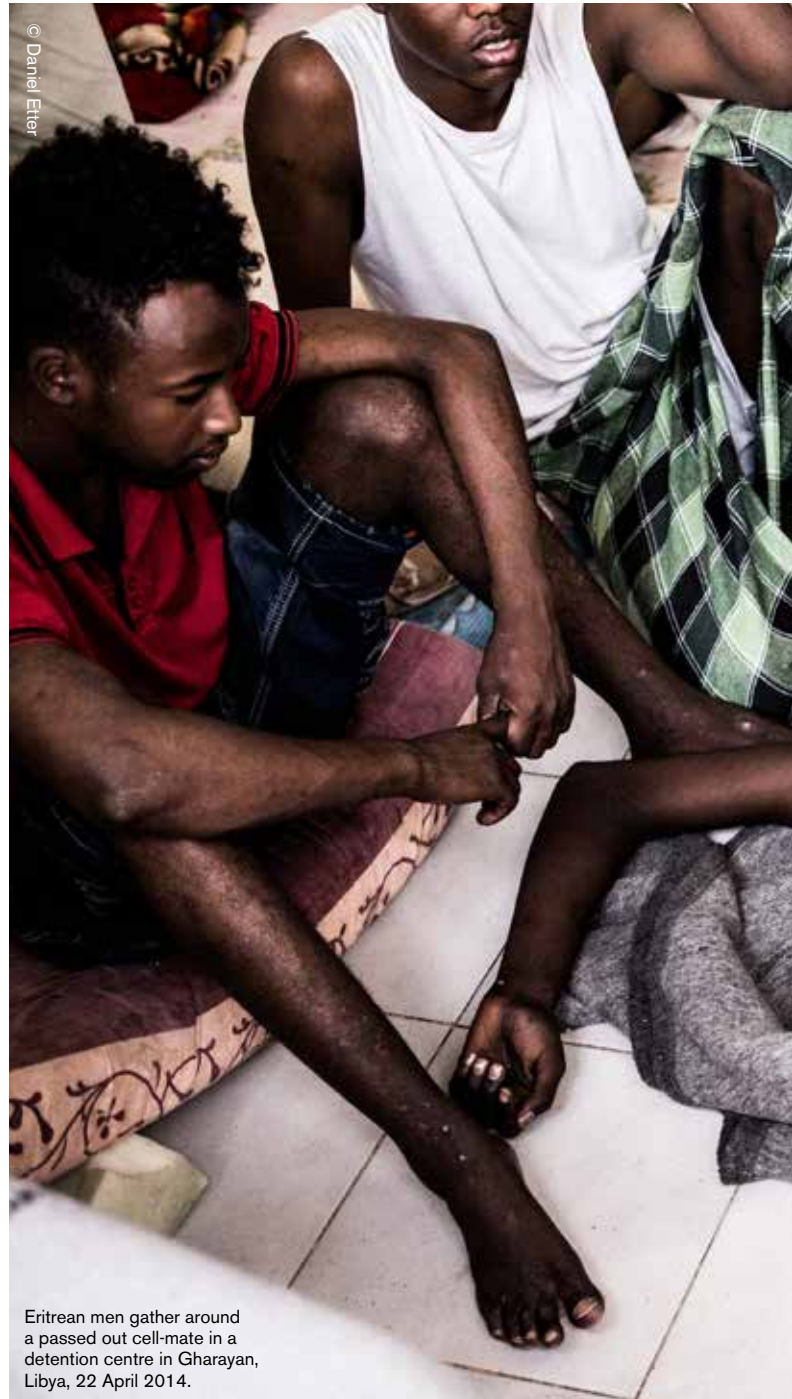
Eritrean men gather around a passed out cell-mate in a detention centre in Gharayan, Libya, 22 April 2014.

All Eritreans interviewed by MSF report having been detained for months during their stay in Libya, often in two or three different