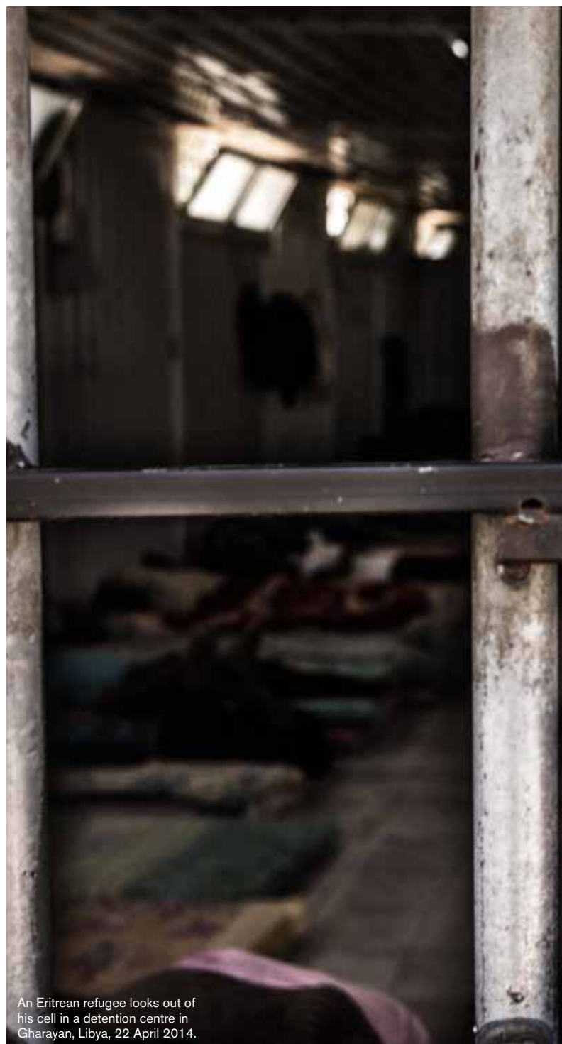
An Eritrean refugee looks out of his cell in a detention centre in Gharayan, Libya, 22 April 2014.