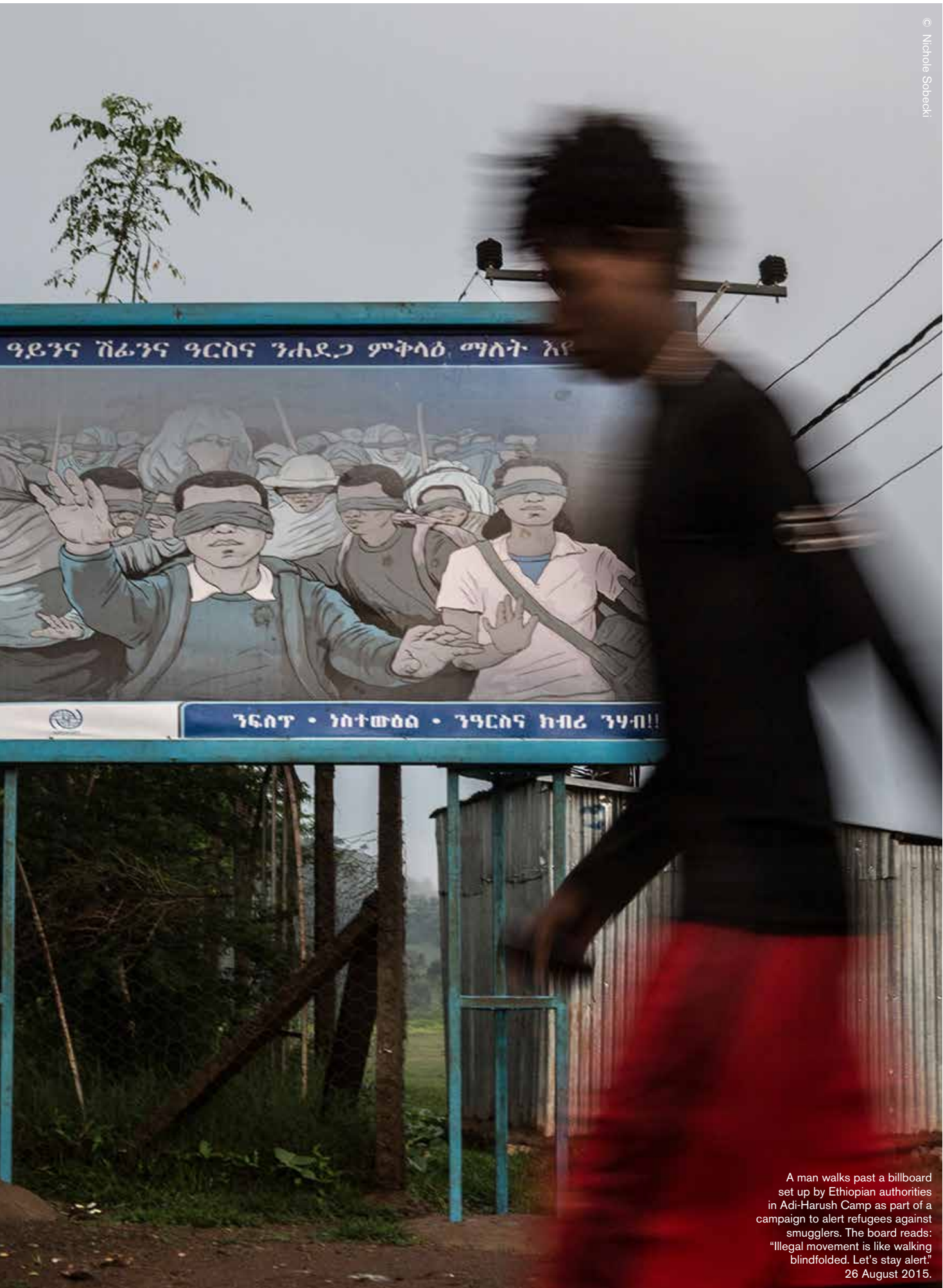
A man walks past a billboard set up by Ethiopian authorities in Adi-Harush Camp as part of a campaign to alert refugees against smugglers. The board reads: "Illegal movement is like walking blindfolded. Let's stay alert." 26 August 2015.