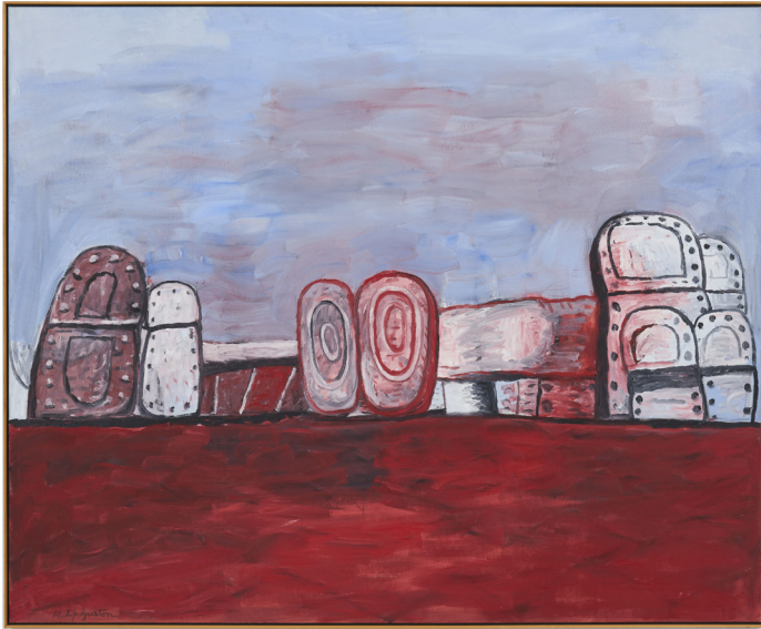
Philip Guston, 'Orders,' 1978