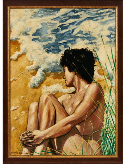
Francis Picabia, 'Nu assis (Seated Nude),' ca. 1942