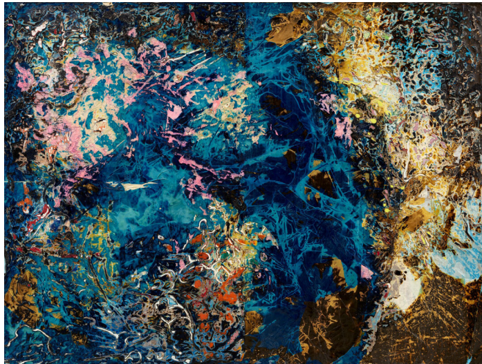
Mark Bradford, 'Pink Pearl,' 2024