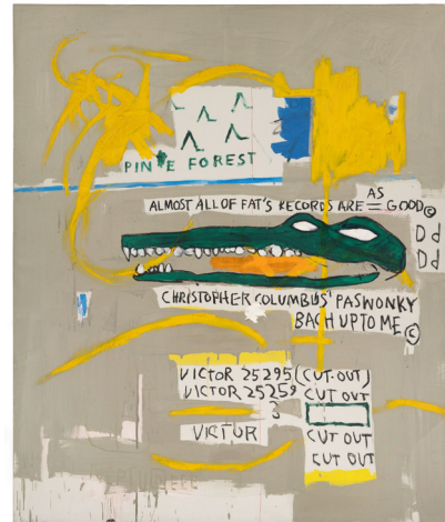
Jean-Michel Basquiat, 'Untitled,' 1988