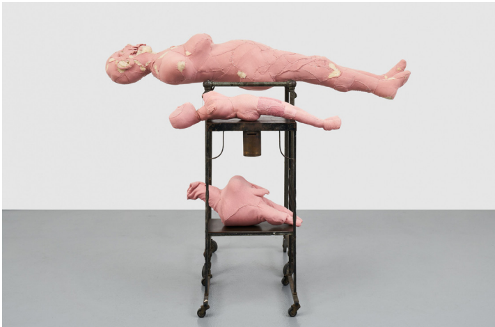
Louise Bourgeois, 'Three Horizontals,' 1998