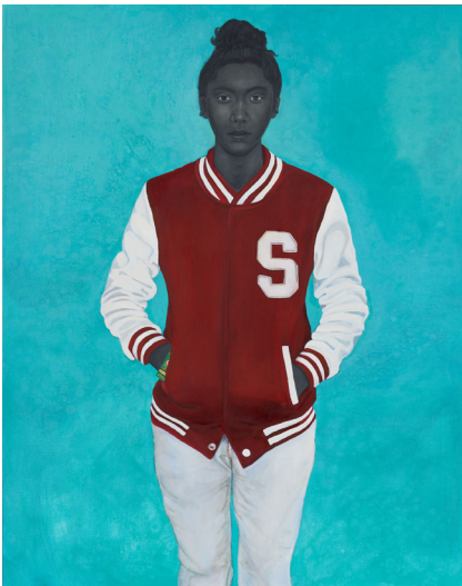
Amy Sherald, 'Varsity Girl,' 2016