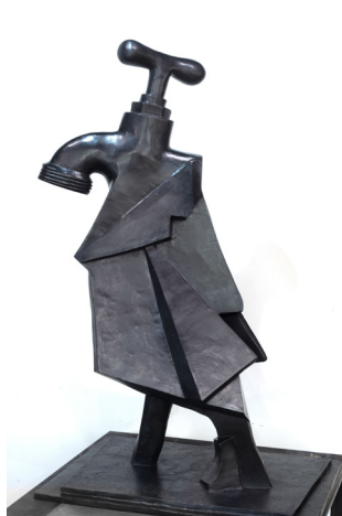
William Kentridge, 'Tap,' 2024