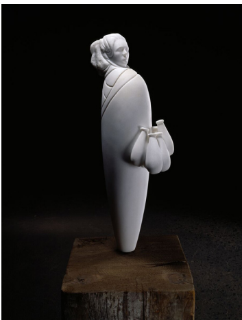
Louise Bourgeois, 'Woman with Packages,' 1987 - 1993