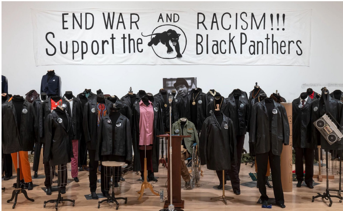
Henry Taylor, 'Untitled,' 2022