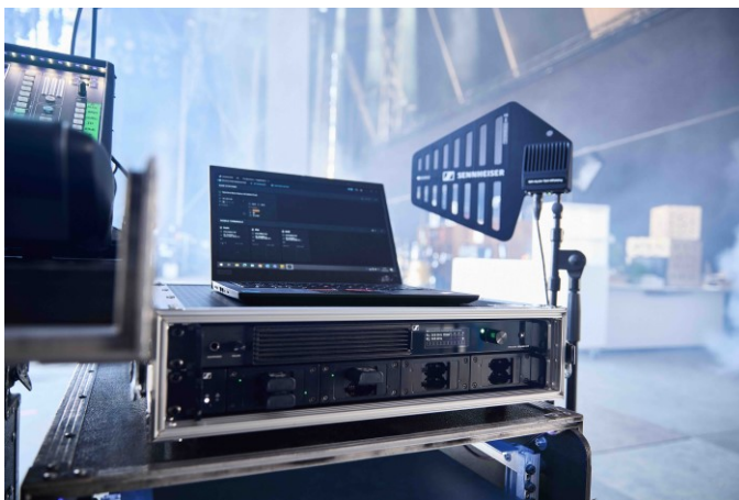
An entire production with mics and IEMs in a 19” 1U rack space. Below the Spectera Base Station is an L 6000 charging station with charging modules for the BA 70 rechargeable battery pack. Spectera uses the same batteries as Evolution Wireless Digital

One of the most stunning innovations in the Spectera ecosystem is certainly the Base Station, which, in a single rack unit with 32 inputs and 32 outputs, replaces a rack-full of wireless mic receivers and IEM transmitters. An entire production could be accommodated in a single wideband RF channel (6 or 8 MHz). The lower footprint continues to the bodypacks, which handle mic/line and IEM/IFB requirements simultaneously. “Having just one pack is not only a great asset for performers,” says Bernd Neubauer, Spectera product management, “it also makes the work of the sound engineer easier, who has just one type of pack and can, if required, quickly add an IEM to a mic. Warehousing also becomes less complex, with just one Base Station and two frequency variants – UHF and 1G4 – for bodypacks and antennas.”