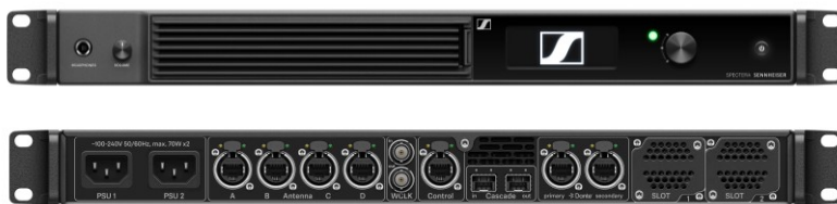
The Spectera Base Station (front and back)

The rack-mount Base Station is the heart of the Spectera ecosystem, and is a true space-saver. It handles up to 64 audio links, meaning 32 inputs and 32 outputs, in a mere 19”, 1U format. One Base Station accommodates up to two RF wideband channels. The Base Station is frequency-agnostic; activation of the respective local license for the Base Station will automatically load the authorised frequency ranges.