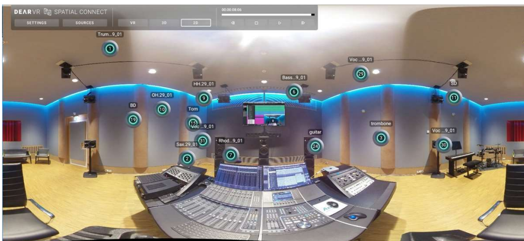
dearVR SPATIAL CONNECT provides a comprehensive overview of a spatial audio session by simulating the audio placements in a VR environment

introduces its VR application to Steinberg's Cubase 12 audio workstation. "With the latest dearVR SPATIAL CONNECT update, we make our VR mixing solution available to a wide range of music producers mixing Dolby Atmos in Cubase 12," says Dear Reality co-founder Christian Sander. "This combination enables them to experience a revolutionary way of working with spatial audio. By optionally adding our dearVR PRO spatializer and the dearVR MONITOR virtual headphone mix room, engineers benefit from a complete spatial audio ecosystem where they can spatialize, control, and monitor spatial audio sessions. "