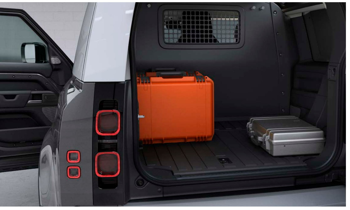
DEFENDER 90 HARD TOP