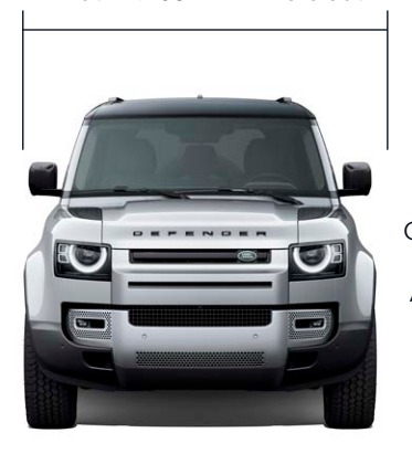
Front wheel track Air suspension 1.706mm<sup>‡</sup> Coil suspension 1.704mm<sup>‡‡</sup>