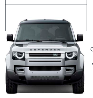
Front wheel track Air suspension 1.706mm<sup>+</sup> Coil suspension 1.704mm<sup>++</sup>