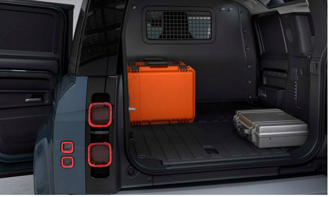
DEFENDER 110 HARD TOP