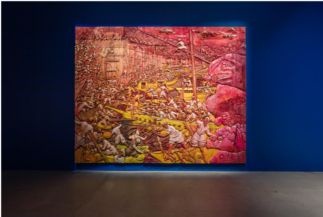
Wael Shawky, 'Cabaret Crusades: The Capture of Constantinople in 1204' (after Jacopo Tintoretto, 1580-1605), 2018 | Hand-carved wood, paint, goldleaf | 330 x 400 cm | 129 7/8 x 157 1/2 in |(WSHA180010)