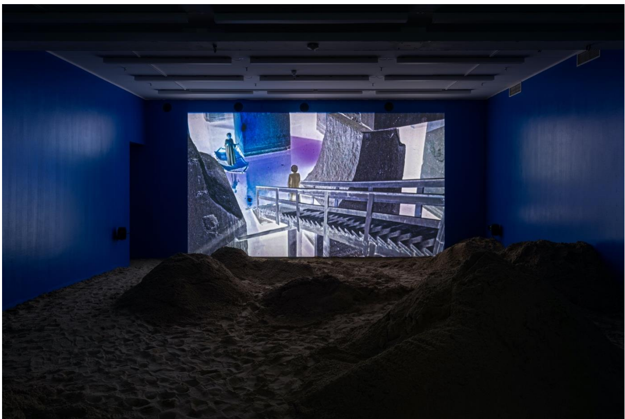
WSHA150012_at Den Frie Centre of Contemporary Art, Denmark_2021-22_019

Cabaret Crusades is the title of a film trilogy that places the history of the Crusades in a new light by approaching it from an Arab perspective. Despite the tumultuous storylines and violent scenes, the films exude a magical realism and beauty. In Cabaret Crusades , Shawky combines seemingly accurate facts with a personal, artistic imagination. This mix of truth and fiction raises questions about the nature of history, and the privileged role of those who write it. Similarities with today's geopolitical context are numerous: the civil war in Syria, the new regime in Afghanistan, or the ongoing Palestinian-Israeli conflict.