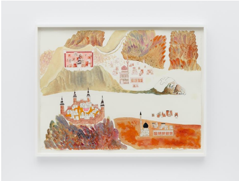
Wael Shawky, 'Cabaret Crusades: Drawing #602', 2021 | Graphite, Ink, oil, mixed media on cotton paper, 57.2 x 76.2 cm 22 1/2 x 30 in | WSHA210002 | © Wael Shawky; Courtesy Lisson Gallery.

Parallel to the film trilogy Cabaret Crusades , Wael Shawky also makes paintings, drawings and wooden reliefs depicting episodes from the history of the Crusades. Painting and drawing are the most obvious and direct media for the artist: they are the disciplines in which he was trained as a student at the Alexandria Academy. For the wooden reliefs, just as for the glass marionettes in the film, Shawky works with experienced craftsmen from the Italian region of Veneto.