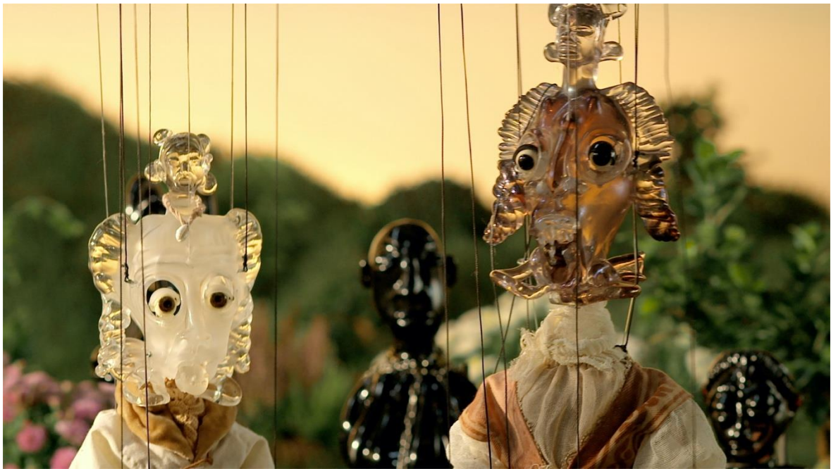
Wael Shawky, 'Cabaret Crusades III: The Secrets of Karbalaa', 2015 HD Film, colour, sound, English subtitles 120 minutes (WSHA150001) © Wael Shawky; Courtesy Lisson Gallery.