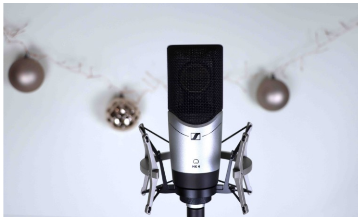
MK 4 pictured with optional MKS 4 shock-mount

With the typical warmth of a studio condenser mic, the MK 4 is a great all-rounder for recording vocals and instruments and is also great on the live stage, for example on guitar amps. It delivers fantastic sound, while still being an affordable choice.