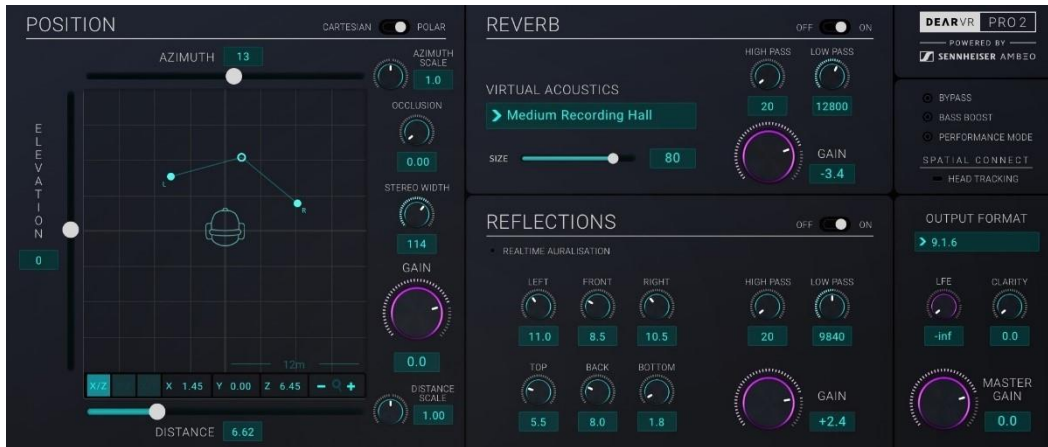
The dearVR PRO 2 graphical interface with XYZ position, early reflections, late reverb, and output sections

With true-to-life early reflections and 46 virtual acoustic presets – from a small car to a large church – dearVR PRO 2 is ideally suited for professional music and postproduction, enhancing them with an accurate perception of direction, distance, reflections, and reverb. The newly added filter modules, each consisting of a high- and low-cut filter, expand the versatility and reduce unwanted rumbling or harsh frequencies in the early reflections or late reverb section.