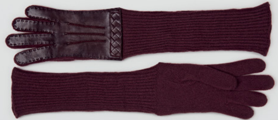
Gigolo red intrecciato nappa top city knot bag 490243/vck11. Brass metal sunglasses 408884/v4450. Dark barolo lamb cashmere glove 497163/v510A.