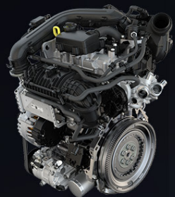
PETROL ENGINE (TSI EVO)