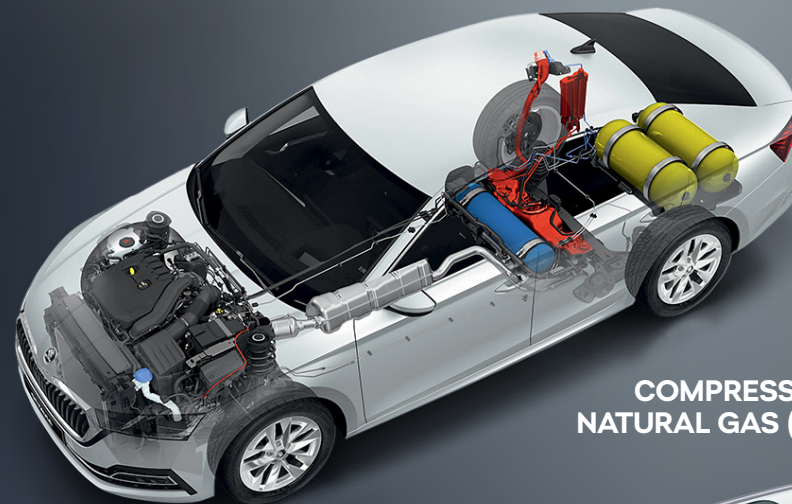
COMPRESSED NATURAL GAS (G-TEC)