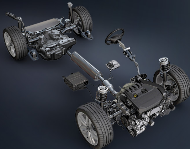
MILD HYBRID ELECTRIC VEHICLE (e-TEC)