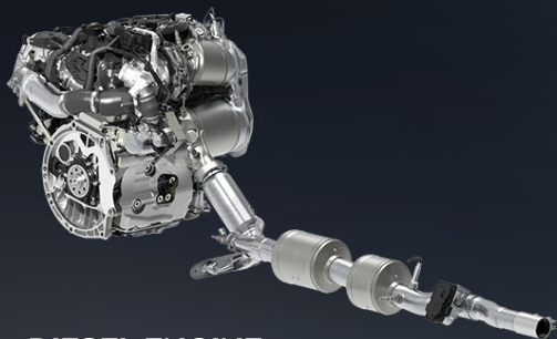
DIESEL ENGINE (TDI EVO)