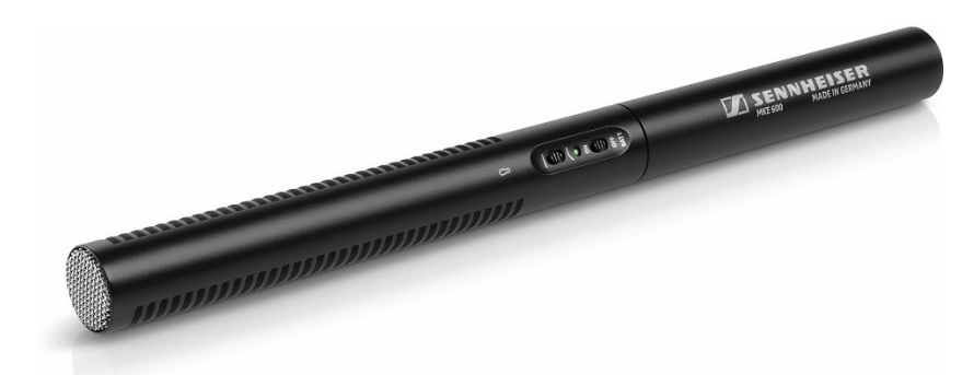
The MKE 600 shotgun microphone focuses on the action