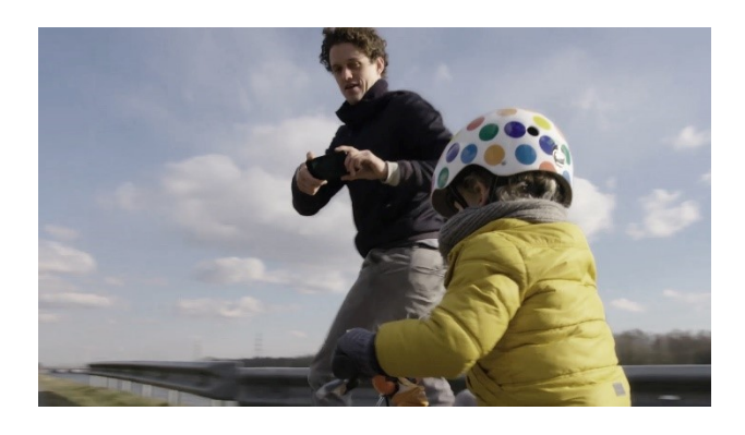
Smartphone solution: The Sennheiser Memory Mic and app for Android and iOS

If you would like to add an atmospheric room component to supplement the direct signal, you can use the MEMORY MIC app to mix the microphone signal from the smartphone in any ratio with the Memory Mic's audio signal, which is recorded wirelessly in excellent quality: WAV files with 16 bit/48 kHz and an audio frequency response from 100 Hz to 20 kHz. Enjoy film-making!