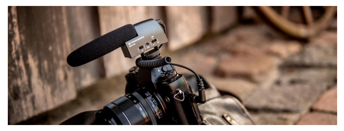
Father's Day gifts for the best videos

Microphones from Sennheiser: Father's Day gifts with perfect sound for passionate filmmakers