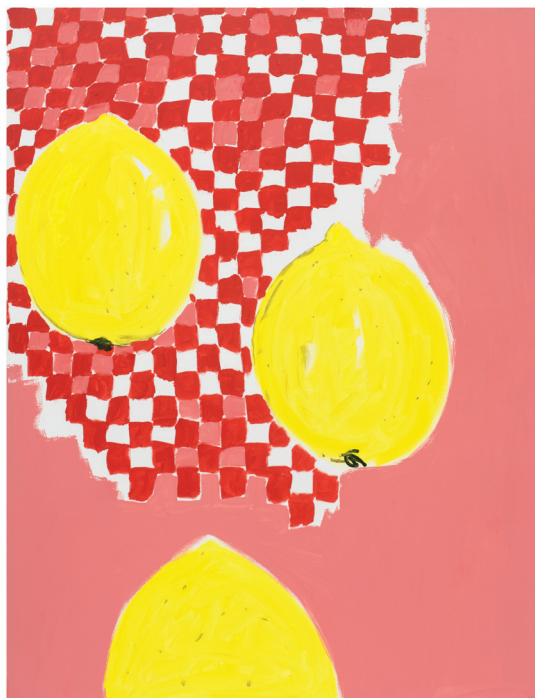
Lemons, 2019 © Xavier Noiret-Thomé