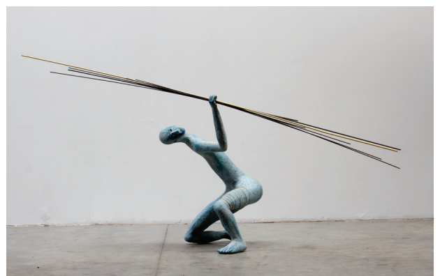
Cosmic Danse , 2018 © Henk Visch