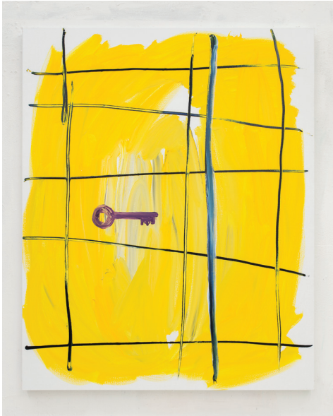
La clef , 2019 © Xavier Noiret-Thomé