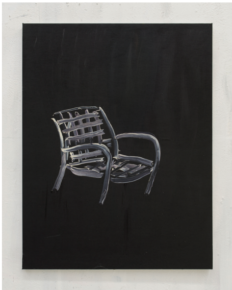
Mon fauteuil , 2019 © Xavier Noiret-Thomé