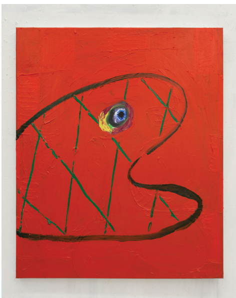
Palette Puppet , 2019 © Xavier Noiret-Thomé