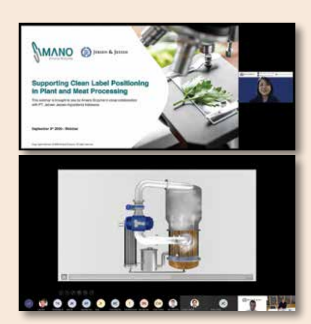
Live webinars by Jebsen & Jessen Ingredients in Indonesia and Jebsen & Jessen Technology in Singapore are keeping customer engagement strong.

Using these insights, we continue to refine our digital event strategy, even as we look forward to the day that we can engage our audiences safely and in-person once again.