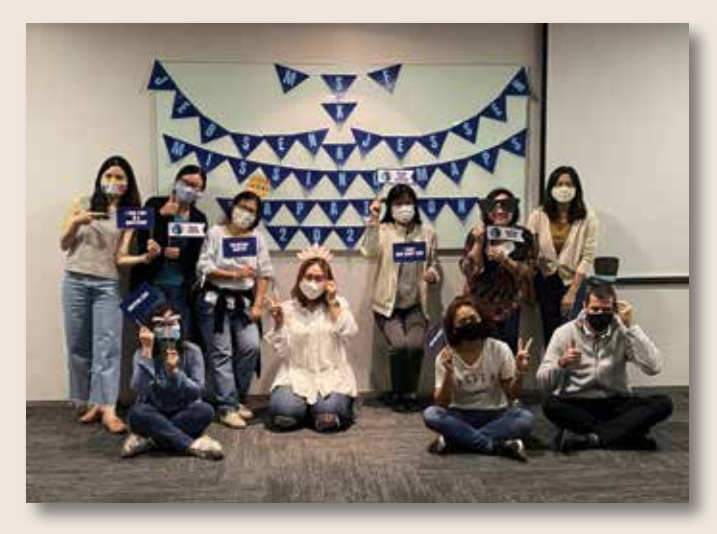
Our map-makers from Thailand!

Nov 2020 The pandemic may have put a stop to in-person events but it cannot stop us from doing our part for the community! The Group's flagship corporate social responsibility (CSR) programme, Meet a Need, took on a virtual form for the first time.