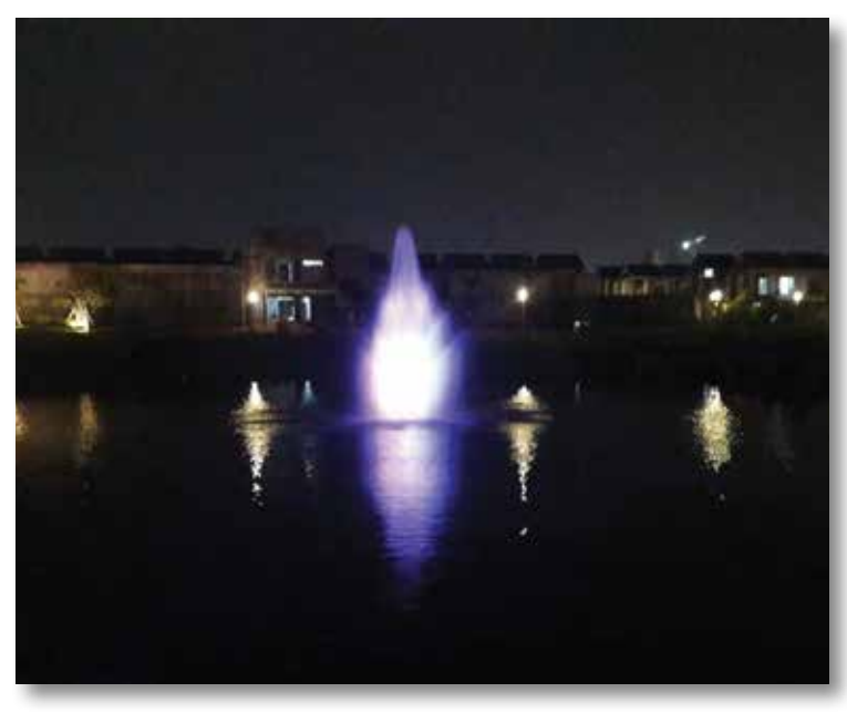
The beautiful Lake Fountain is located within the premium housing area of Serpong.

The Aquamaster System is often selected by customers as an easy solution to beautiful landscaping aesthetics and maintenance.