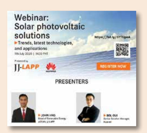
An example of JJ-LAPP's webinars on industry trends.

Jebsen & Jessen Ingredients also adapted quickly to the online space, using relevant topics like 'Food Ingredients Adaptation to Thrive in the New Normal Era' to attract hundreds of participants. Its webinar on 'New Skin Concerns & Natural Solutions' discussed how the increased use of anti-bacterial products like hand sanitisers could damage the skin and offered innovative formulation ideas in the form of natural active ingredients with anti-bacterial properties.