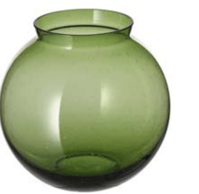
<No intersecting link>

KONSTFULL vase 12,99 Tinted, clear lacquered glass. Designer: Ilse Crawford. Ø20, H19cm. Green 305.119.62