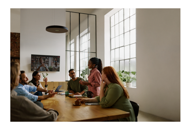
Sennheiser Set to Provide a New Perspective on Meetings at InfoComm Orlando 2023

Newest member of the TeamConnect Family will be front and center, showcasing the unprecedented flexibility it brings to meetings for every room size and setup