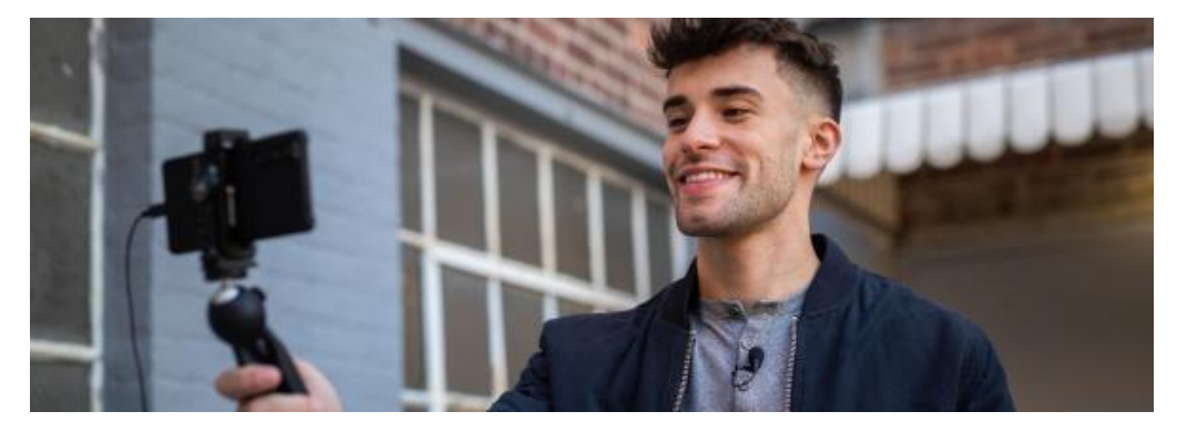
Simple and effective audio solution for vloggers and podcasters Sennheiser XS Lav mics for content creation

Wedemark, 7 April 2021 – There probably isn't a faster and simpler way to add a highquality vocal track to your videos: Just clip on Sennheiser's new XS Lav mic, connect it to your mobile device or computer and start rolling. Whether you're podcasting, recording a voice-over, interviewing or vlogging – this omni-directional clip-on mic will deliver clear and natural sound. Available as XS Lav Mobile with TRRS connector, XS Lav USB-C with USB-C connector, and XS Lav USB-C Mobile Kit with an additional Manfrotto PIXI Mini Tripod and Sennheiser Smartphone Clamp.