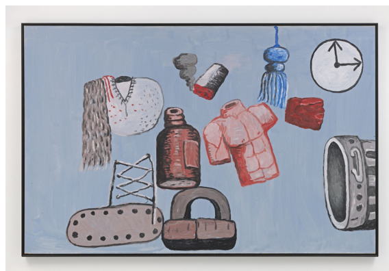
Philip Guston, Letter to a Friend, 1977