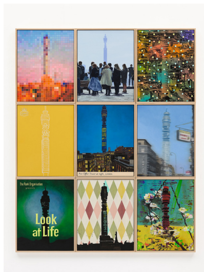
Keith Tyson, Nine Periods of a Pendulum, 2019