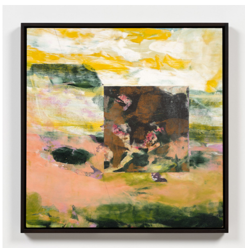
Jack Whitten, Psychic Square, 1969