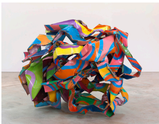
John Chamberlain, FRANCYESCORT, 2002