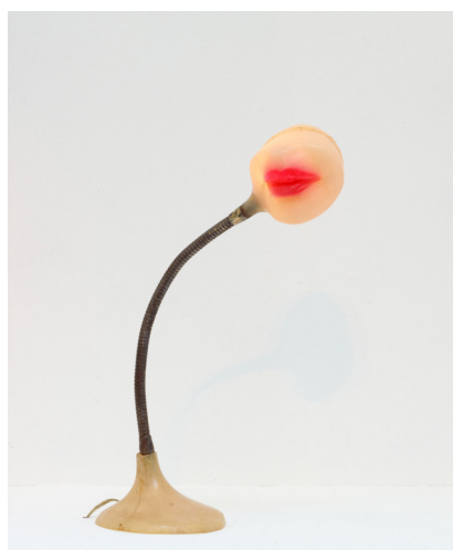
Alina Szapocznikow, Lampe-bouche (Illuminated Lips), 1966