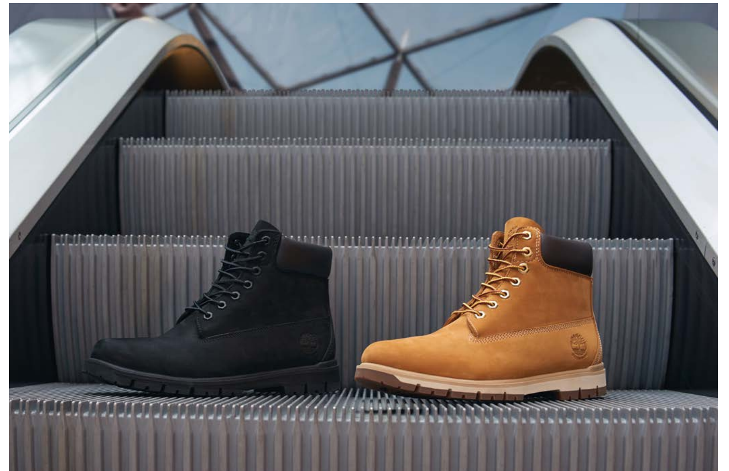
RADFORD YELLOW CA1JHF BLACK CA1JI2