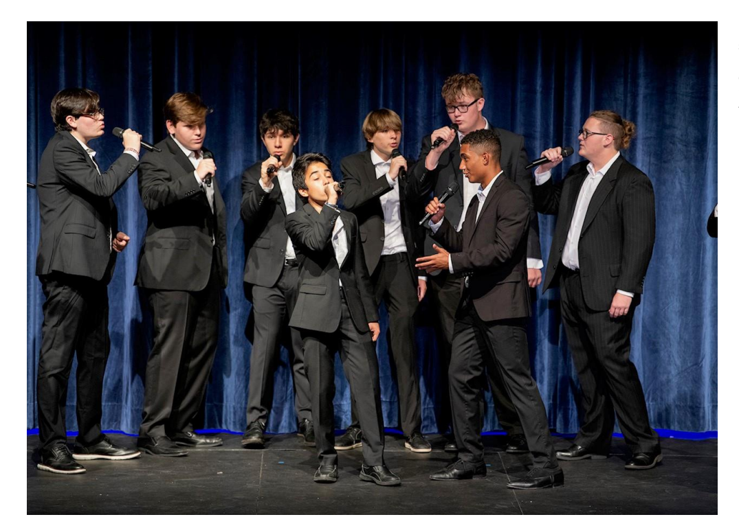
Berkeley Prep's talented student body uses EW-DX microphones for a variety of performances, including choir, musical theater and band.

With so many daily activities across campus that require wireless audio both indoors and out, navigating air traffic and buzzy Downtown Tampa to dodge dropouts and interference can feel like an obstacle course. Berkeley Prep needed a wireless system that could handle the crowded RF spectrum while minimizing the legwork for Christopher and other wireless users. EW-DX offers the lowest latency on the market (1.9 milliseconds) and eliminates the need for frequency calculation thanks to its equidistant frequency spacing which does not pollute available spectrum with intermodulation. In Christopher's words, "with the EW-DX units I don't have these [frequency coordination] issues. They don't get stomped on by anything."