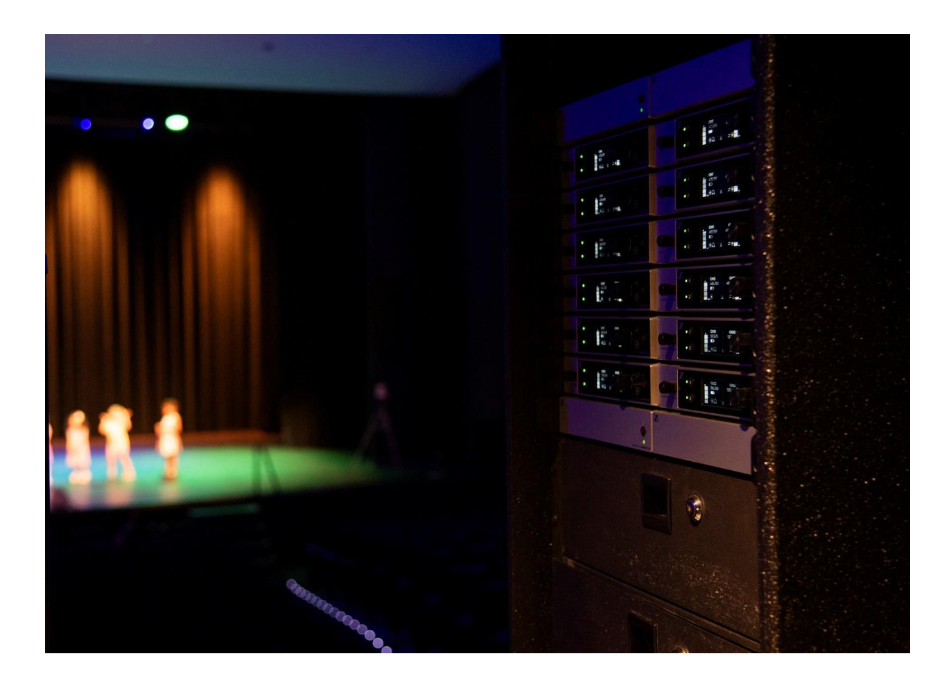
Berkeley Preparatory School upgrades to Sennheiser's EW-DX System for a networked, campus-wide and consistent wireless audio solution

The prestigious Florida day school has outfitted multiple performance spaces including its 820-capacity theater and chapel with 40 channels of Sennheiser's newest wireless microphone system