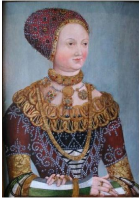
Portrait of a Lady Attributed to Hans Krell