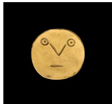
Pablo Picasso Medaillon Visage géométrique au Traits 1967