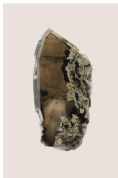
Octave Vandeweghe Cultured Manners #85 Antwerp, 2017