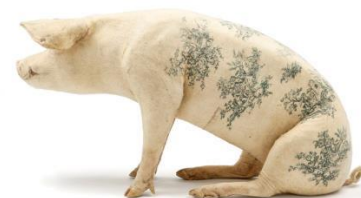
Wim Delvoye Toile de Jouy 2006 © Studio Wim Delvoye