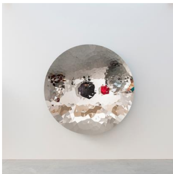
Anish Kapoor Random Triangle Mirror 2017 © Courtesy The Artist, Anish Kapoor 2018