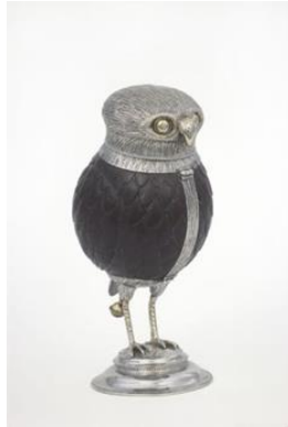
Owl Cup Master in Pelican. Collection King Baudouin Foundation, permanent loan to DIVA