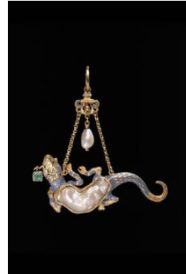
Salamander-Shaped Pendant. Salting Bequest, M.537-1910