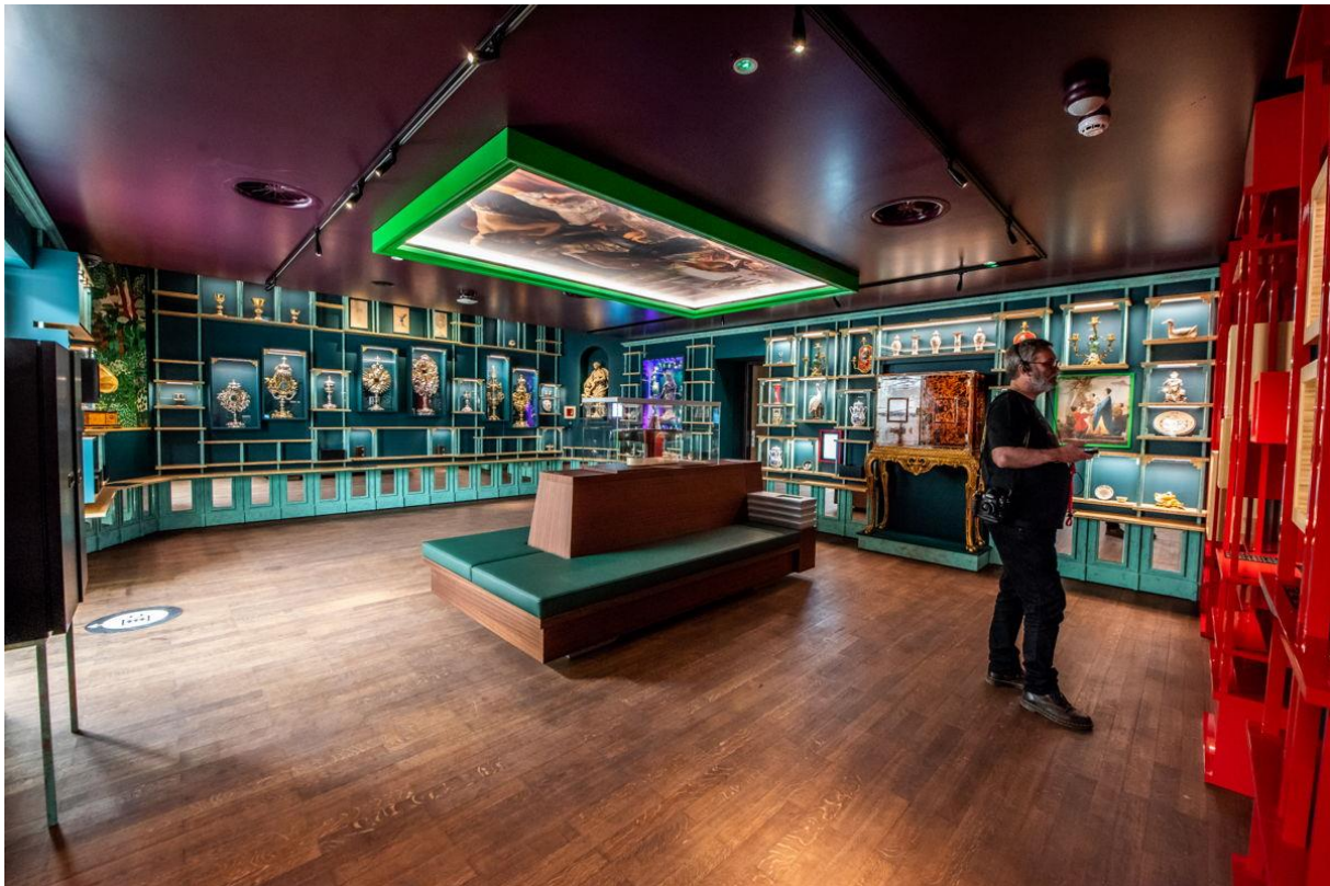
DIVA's Room of Wonder

A tour of DIVA's collection starts in her Room of Wonder. In this contemporary interpretation of a Wunderkammer , or cabinet of curiosities and rarities, valuable objects from every corner of the globe are brought together in a cocoon of luxury. Visitors learn about Antwerp's illustrious past, about the city that led the way in the production and distribution of art and luxury articles in the sixteenth and early seventeenth centuries. Silverware, jewellery, precious stones and exotic curiosities like coconuts, shells and coral were particularly sought after. In her Room of Wonder, DIVA tells visitors all about these objects and their collectors.