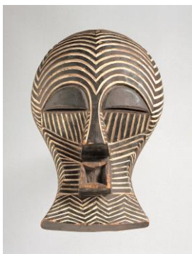
Mask (Kifwebe) Collection MAS, Collection Africa, Inv. AE.0335