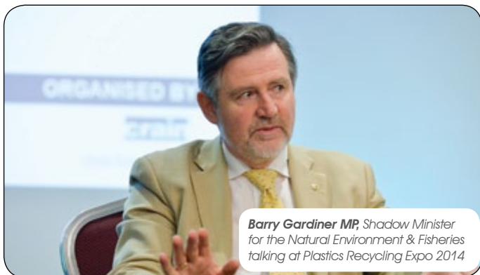
Barry Gardiner MP, Shadow Minister for the Natural Environment & Fisheries talking at Plastics Recycling Expo 2014

PRS will host the Plastics Recyclers Europe's (PRE) Working Group meetings. PRE represents approximately 80% of European mechanical recycling capacity and has over 115 members from all over the EU. PRE's mission is to promote plastics recycling in Europe and to create a good business climate for plastics recyclers. There are 8 Working Groups within PRE which represent particular interest groups - depending on the type of the polymer or type of waste processed: Crates & Pallets, ELV, HDPE, LDPE, Mixed Plastics, PET, PVC and WEEE. The Working Group meetings gather around 100 plastics recyclers. There will also be a conferences on the exhibition floor.