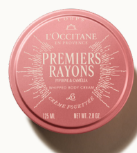
Premiers Rayons Perfumed Light Body Cream 125ML €29