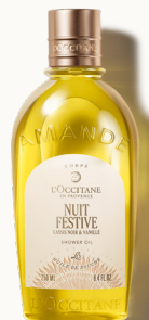
Nuit Festive Shower Oil 250ML €20