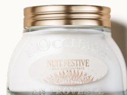
Nuit Festive Milk Concentrate 200ML €49