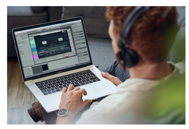
dearVR MIX provides you with a reliable and consistent monitoring experience, no matter whether you're in the studio or on the road

The plugin offers three world-class reference mix rooms with four selectable mono and stereo loudspeaker positions. Furthermore, each mix room can be adapted to the user's taste by controlling the amount of diffusion and setting the perfect balance between overall colouration and localisation based on the patented Clarity algorithm from Sennheiser AMBEO.