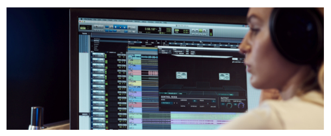
Turn your headphones into a world-class mix room