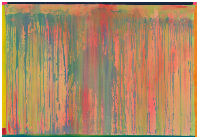
Frank Bowling, 'Early Pour,' 2024