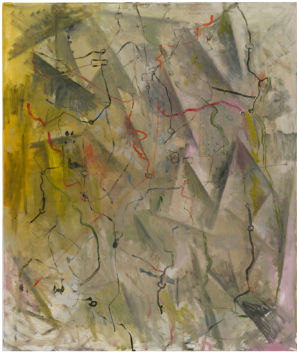
Guillermo Kuitca, 'Untitled,' 2023

Alongside the fair, Rashid Johnson will present new paintings, sculptures and a film at the gallery's space on rue François 1er in a show entitled ' Anima '.