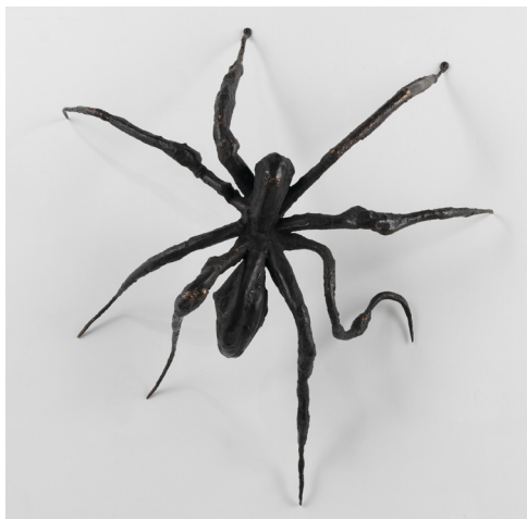
Louise Bourgeois, 'Spider I', 1995

Hauser Wirth celebrates the fair's return to the historic Grand Palais with a firework of historic and contemporary masterpieces, showcasing the caliber of the gallery's multigenerational program. The selection will spotlight many artists who have profound links to Paris, including the influential French-born, New York-based artist Louise Bourgeois , whose masterpiece 'Spider I' (1995) from the artist's iconic Spider Series will climb the booth's walls. Historic highlights include the oil on canvas 'Propagation-Yellow-S' (1971) by Takesada Matsutani , who moved to the city in 1966 and established his base there, as well as 'Red, Blue, & Black (Paris Series #4)' (1989) by Ed Clark , exemplifying 'the big sweep,' his celebrated painting technique developed in Paris. These historic works will be accompanied by Philip Guston's monumental 'Tears' (1977), created after the artist turned away from abstraction to assert an unprecedented new figural language.