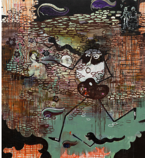
Héléne Delprat, 'Autoportrait en peintre pressé,' 2024