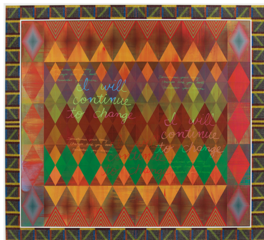
Jeffrey Gibson, 'I will continue to change,' 2024