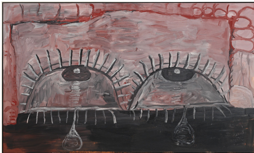
Philip Guston, 'Tears', (1977)

Hauser Wirth celebrates the fair's return to the historic Grand Palais with a firework of historic and contemporary masterpieces, showcasing the caliber of the gallery's multigenerational program. The selection will spotlight many artists who have profound links to Paris, including the influential French-born, New York-based artist Louise Bourgeois , whose masterpiece 'Spider I' (1995) from the artist's iconic Spider Series will climb the booth's walls. Historic highlights include the oil on canvas 'Propagation-Yellow-S' (1971) by Takesada Matsutani , who moved to the city in 1966 and established his base there, as well as 'Red, Blue, & Black (Paris Series #4)' (1989) by Ed Clark , exemplifying 'the big sweep,' his celebrated painting technique developed in Paris. These historic works will be accompanied by Philip Guston's monumental 'Tears' (1977), created after the artist turned away from abstraction to assert an unprecedented new figural language.