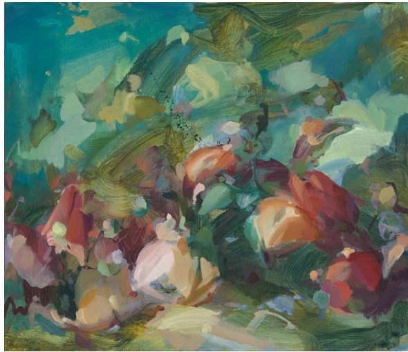
Flora Yukhnovich, 'Fête galante IV,' 2024