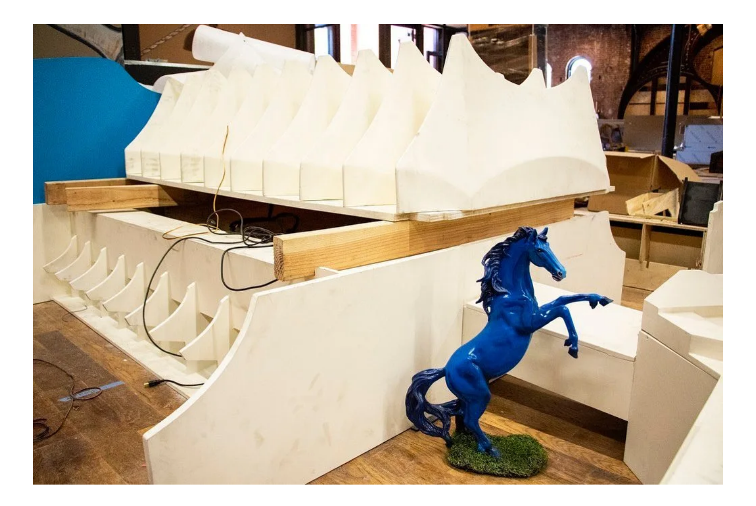
downtown Denver and the state capitol,