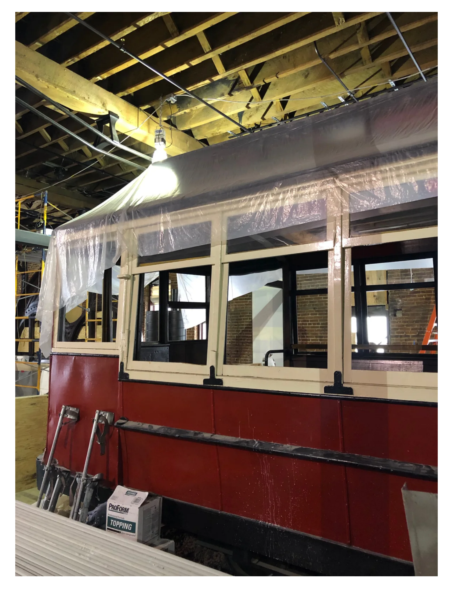
the musical Red Rocks hole,

You'll see the new location of Denver's beloved streetcar #54,