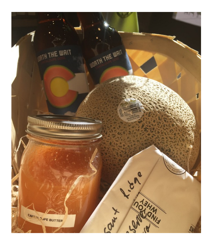
RFGA Worth the Wait Cantaloupe Gose beer bottling at CO-Brew RAW video