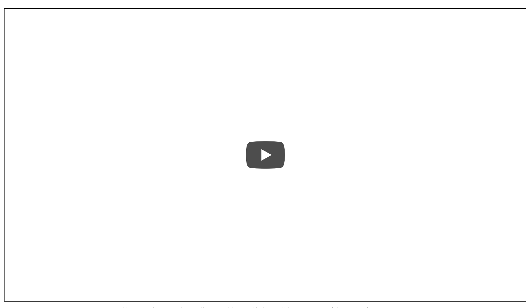
Pumpkin harvesting crews blow off steam with pumpkin box-building races at RFGA member farm Proctor Produce