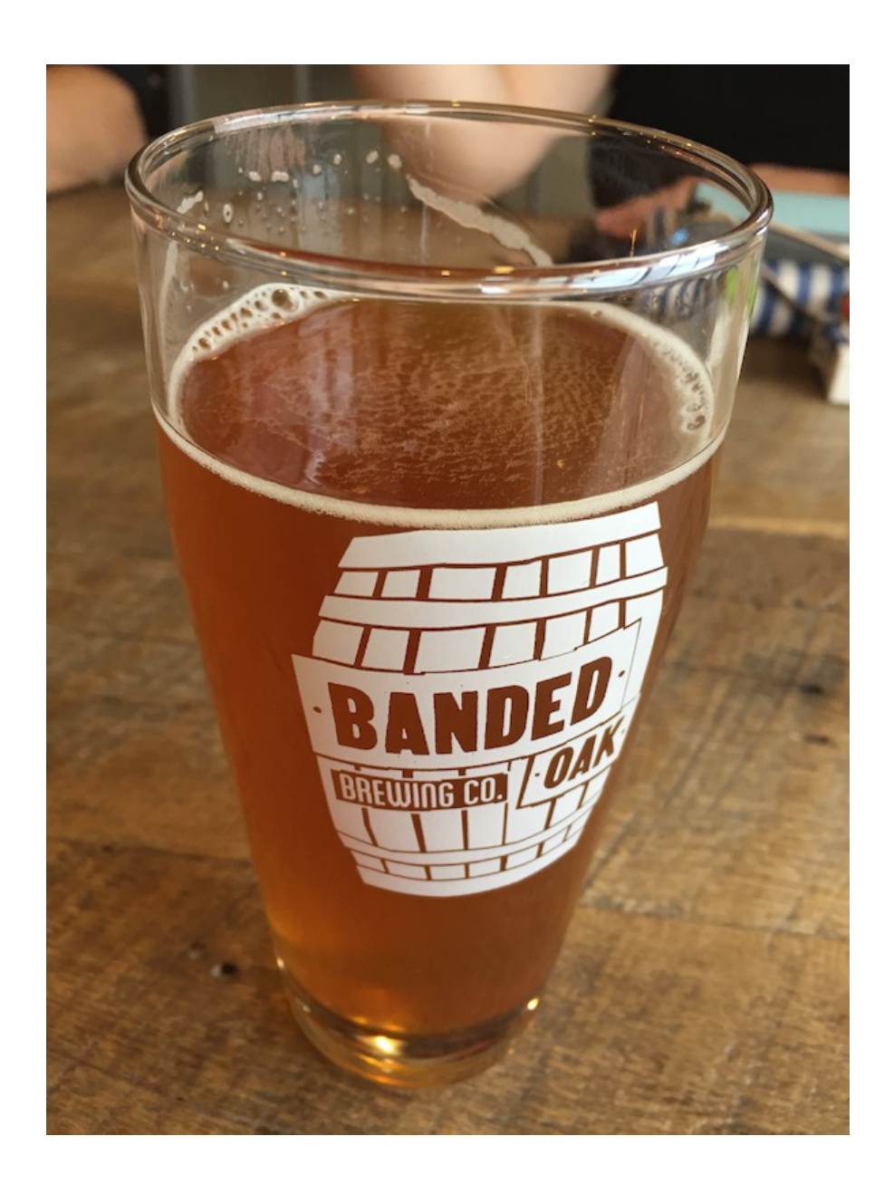
Banded Oak Brewing website