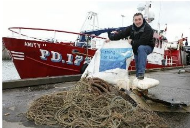
'Fishing for Litter' programme.