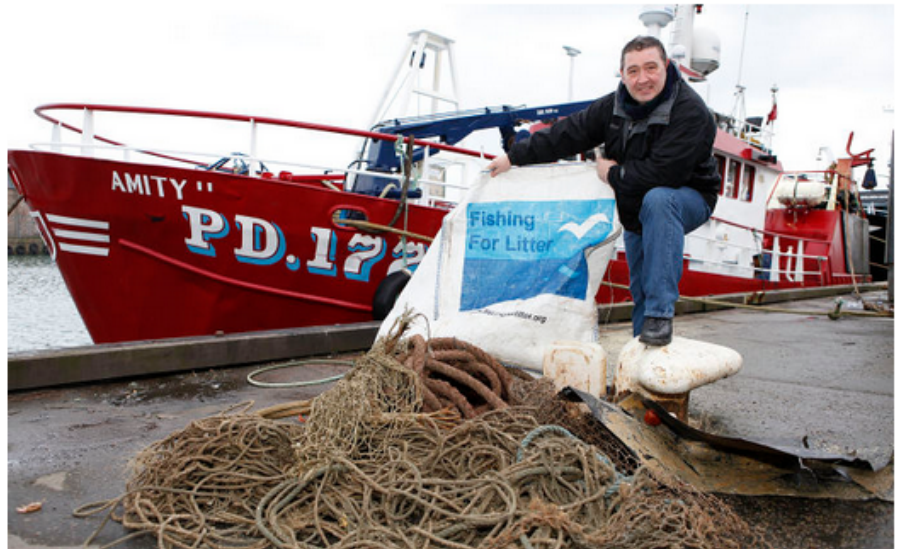
The 'Fishing for Litter' scheme is just one of many that has been launched in response to the growing problem of marine litter

Europêche has pledged its committed to supporting these actions and believes all fishermen should be informed of the significant role they can play in not only taking precautions against littering but also actively engaging in projects to proactively protect the environment.