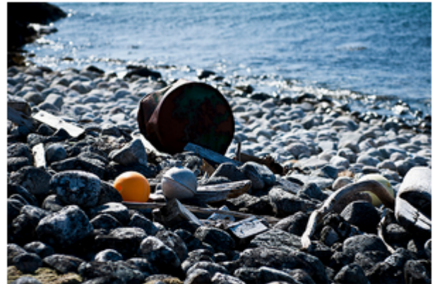
strandrydding_050512_web-40

At a meeting between the two organisations held this week in Brussels, Europêche pledged to work with its member organisations to raise awareness of the issue and encourage fishermen across Europe to get involved in clean up initiatives.