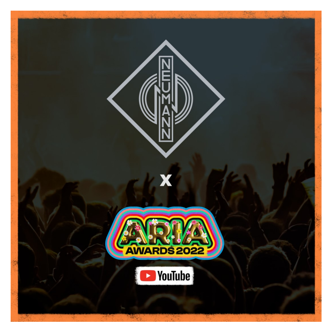
Neumann and Sennheiser partner with 2022 ARIA Awards

Sydney, 16 November, 2022 – <u>Neumann.Berlin</u> and <u>Sennheiser</u> have announced a historic partnership with the 2022 ARIA Awards, Australia's preeminent music industry awards event that is airing on Thursday 24th November from 7:30pm on Channel 9, 9Now and streaming internationally on YouTube.