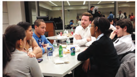
Kirkland hosted the New York City Urban Debate League for two tournaments this spring.