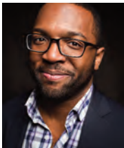
Baratunde Thurston