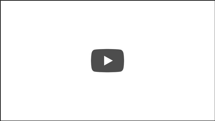
Banded Oak Hiramkata Farms Crenshaw Melon IPA juice mixing broll