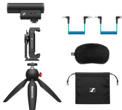
MKE 400 Mobile Kit