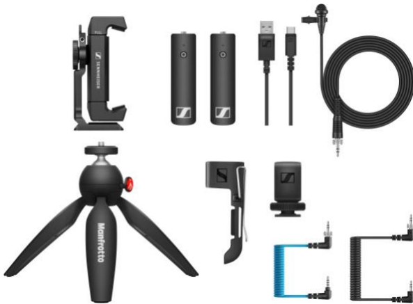
The XSW-D Portable Lav Mobile Kit with the new XSW-D Mobile cable

Sennheiser's wireless lavalier solution is not only supplied with the Smartphone Clamp and Mini Tripod but also includes an additional TRS-TRRS cable for connection to smart devices (also available separately as XSW-D Mobile cable). This special cable features an attenuator to ensure optimum levels for mobile devices.