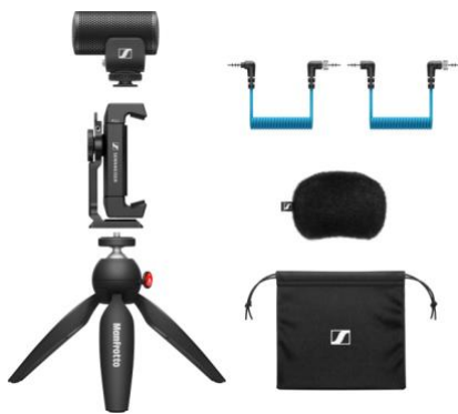
MKE 200 Mobile Kit

As video recording often happens on various devices, both the MKE 200 and MKE 400 include 3.5 mm TRS and TRRS cables for use with DSLR/M cameras and mobile devices, respectively. With the Smartphone Clamp and Manfrotto PIXI, the Mobile Kit versions have vloggers and creators prepared for all recording situations.