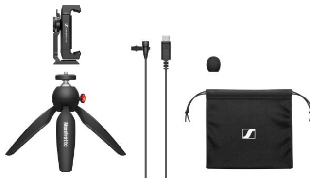
XS Lav USB-C Mobile Kit

This kit adds the Smartphone Clamp and PIXI to Sennheiser’s wired USB-C lavalier microphone to create an ideal vlogging and podcasting bundle.