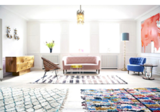
Copenhagen – The Apartment