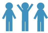
U.S. Entrepreneurial Leaders