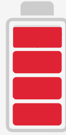
98% APPLIED WHAT THEY LEARNED IN THE U.S.

A YEAR AFTER RETURNING FROM THEIR YLA FELLOWSHIPS