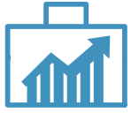
U.S. Top Business Leaders

YLA FELLOWS PARTICIPATE IN THE U.S. ORIENTATION IN TEMPE, ARIZONA AND YLA CLOSING FORUM IN WASHINGTON, D.C. , AS WELL AS NETWORKING EVENTS WITH: