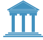
U.S. Government Representatives