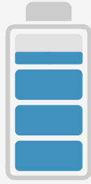
84% ATTRACTED NEW RESOURCES

After successful completion of the U.S. Fellowship and Entrepreneurial Leadership Curriculum, YLA Fellows continue their collaboration with U.S. partners and have access to ongoing professional development opportunities, mentorships, networking, and alumni activities. YLA Fellows will have the chance to welcome a Fellowship host to their country through the Outbound Program, sharing their expertise on the entrepreneurship climate in their country.