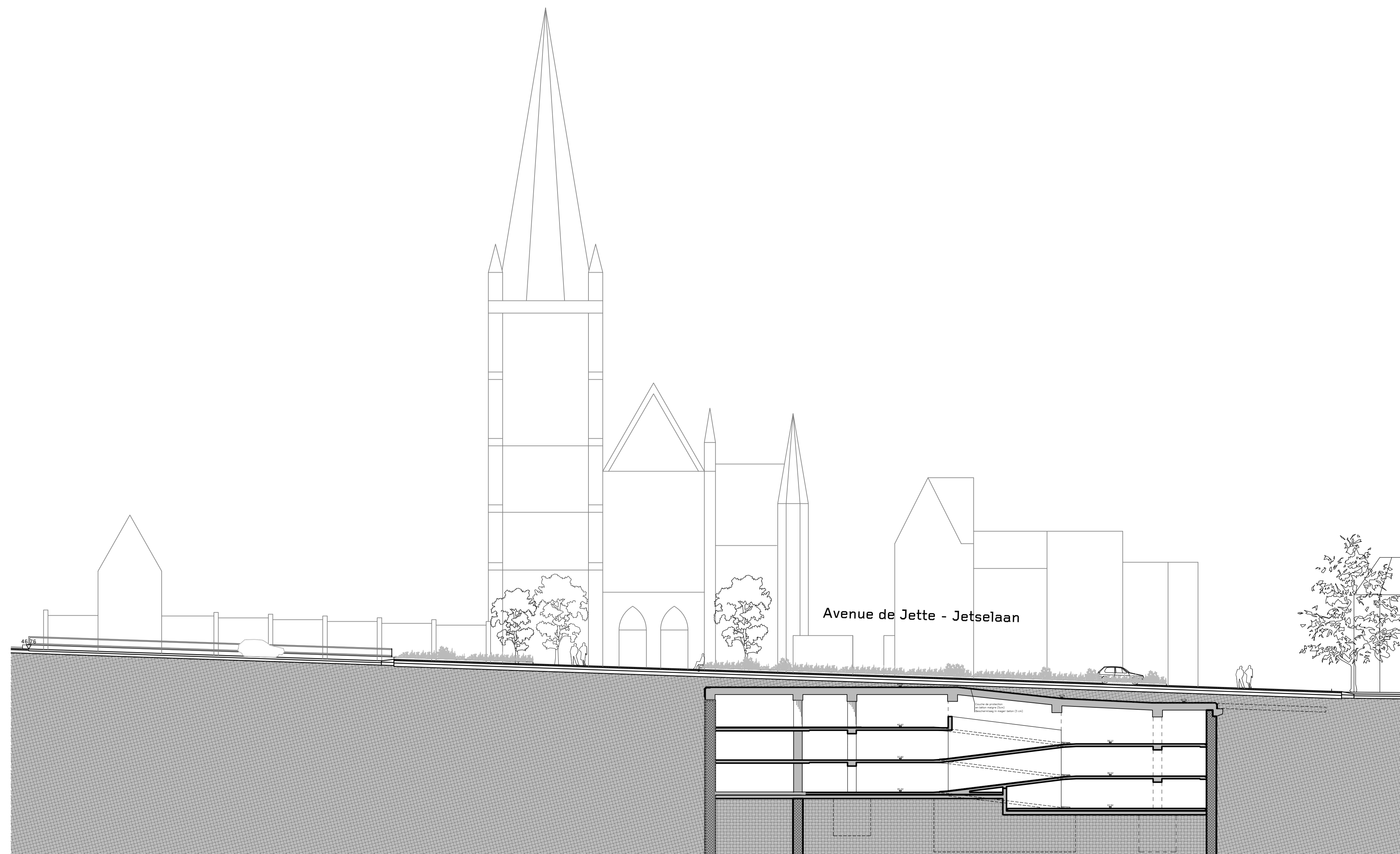
Coupe AA Snedes AA