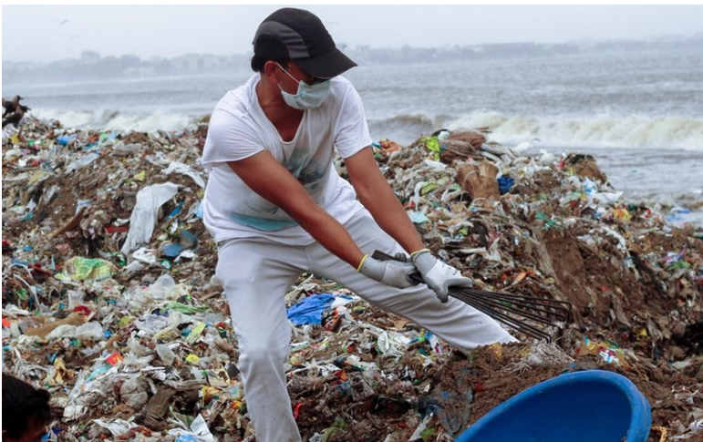
A volunteer hard at work at Versova Beach

WFO tracks the latest news and developments on marine litter to bring you its monthly overview on the issue. Working on solutions? Send us your story to be in next month's edition!