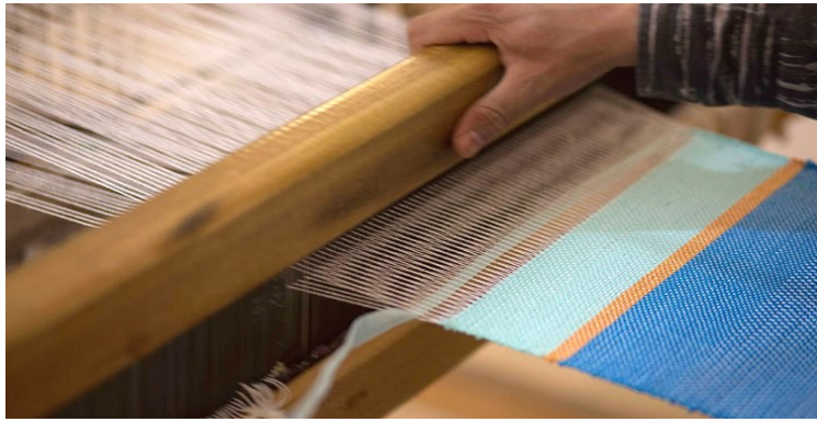
Weaving strips of plastic and cotton using traditional techniques