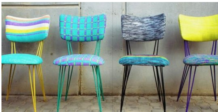
The "Grammys" collection is inspired by a chair owned by one of their grandmothers