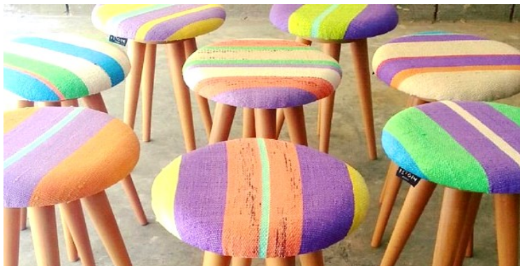
Turning plastic bags into designer furniture