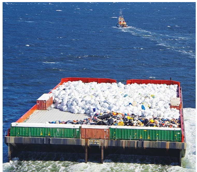
A 100-meter barge for major a shoreline cleanup