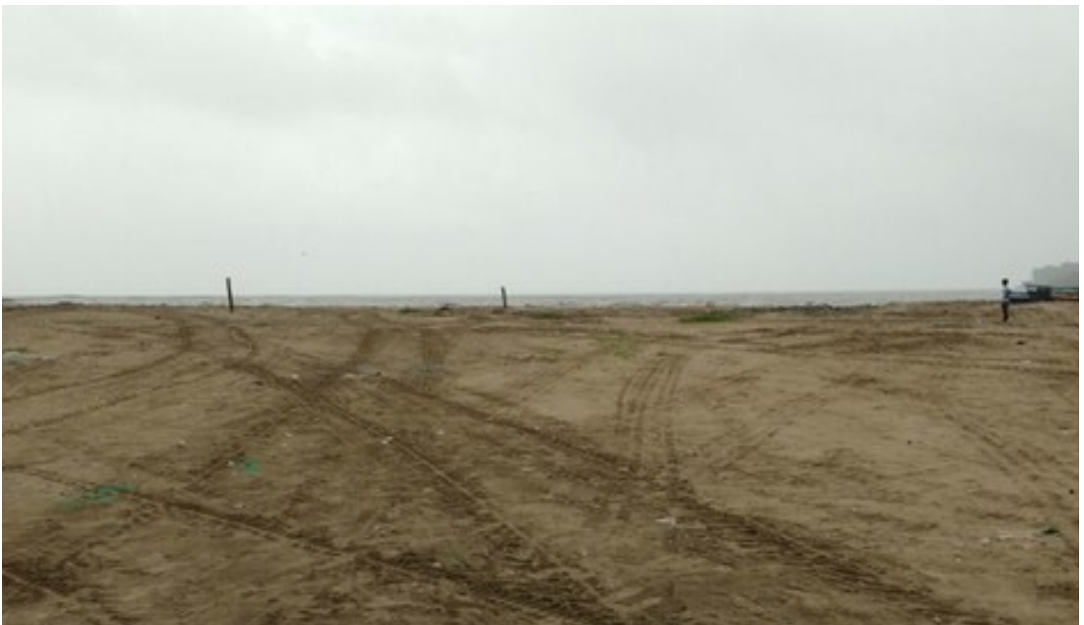
The beach after a five-hour cleanup, almost 300 tons of litter collected, shared on August 6 by Gaurav (Twitter: @Gaurav_bs )