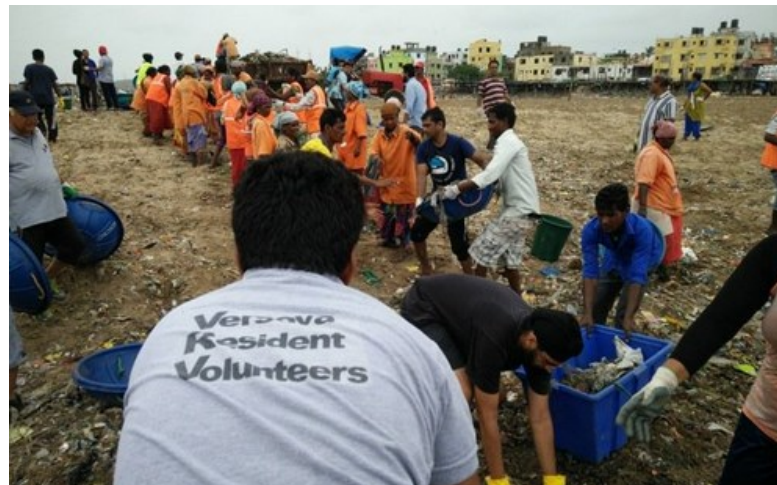
Versova Resident Volunteers joining forces during the cleanups