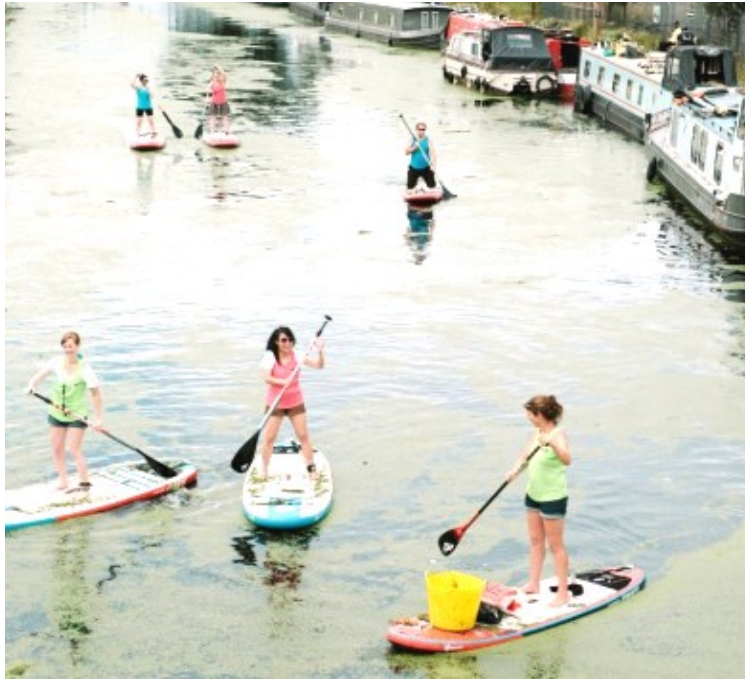
Trash4Treats paddleboard sessions