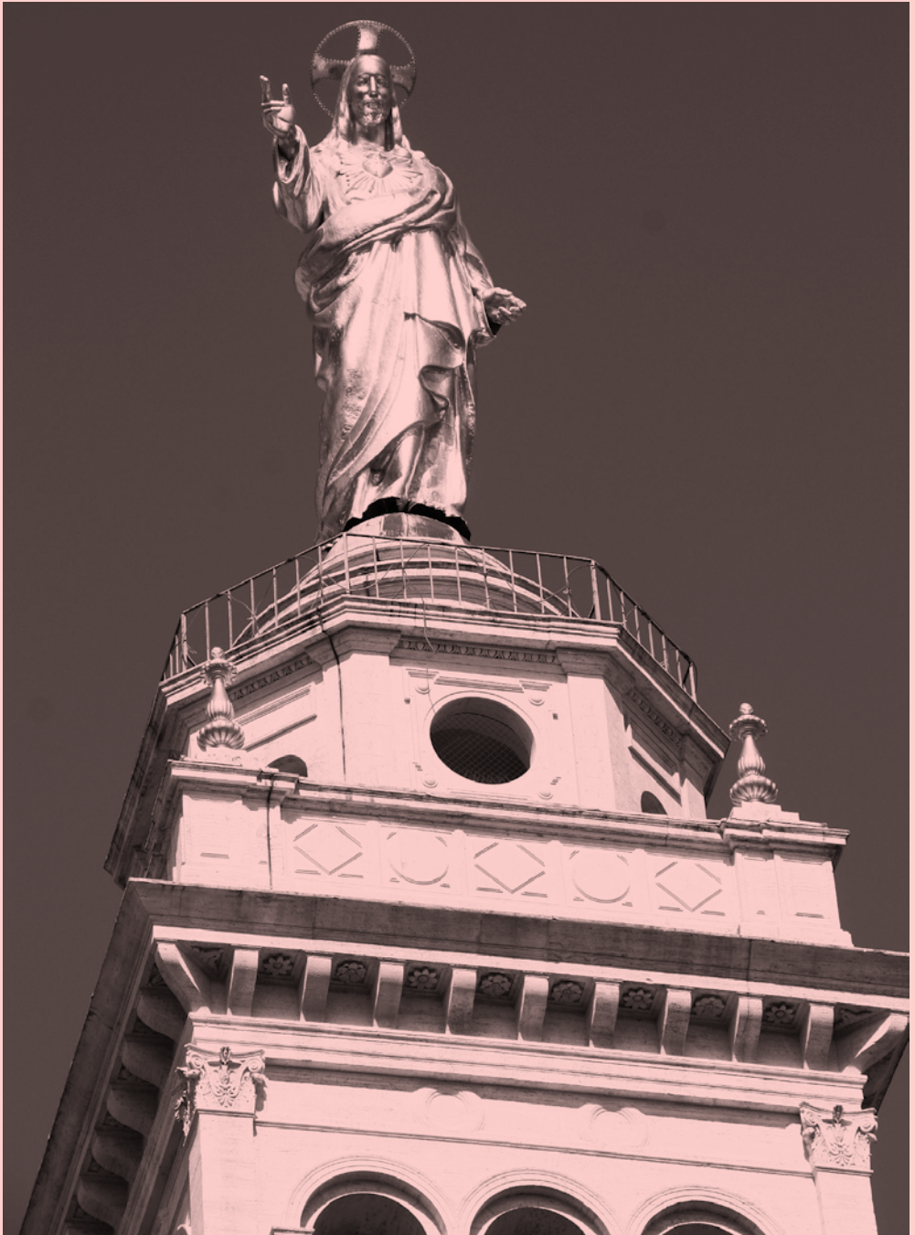
Our view from the jury room at eurobest 2016, Rome