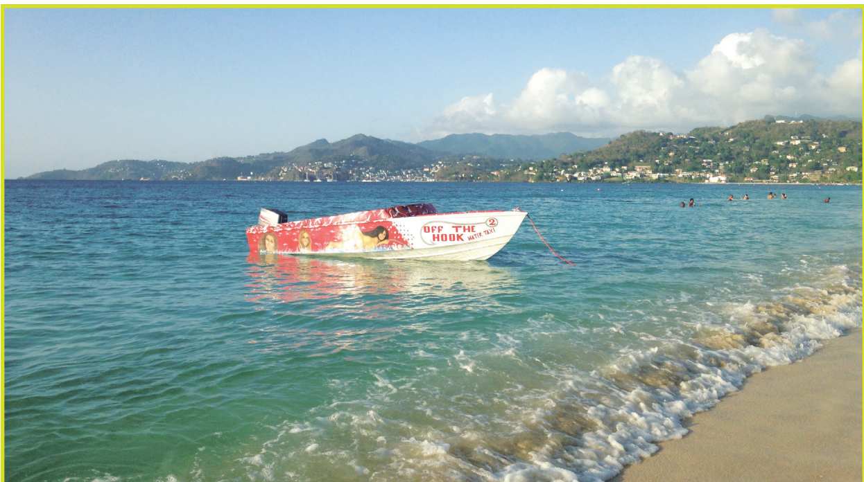
Figure 7: Development of Grande Anse beach is one element of Grenada’s Blue Growth Coastal Master Plan.

The OECS countries and territories need to lead and champion the process themselves, if it is to