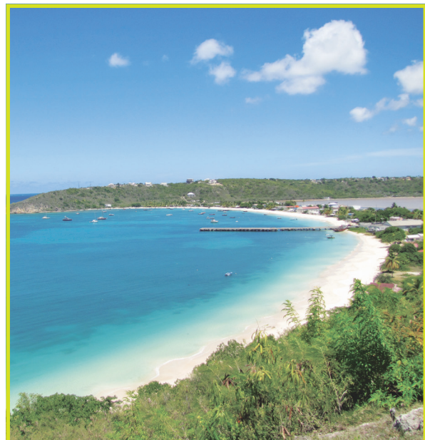
Figure 11: Anguilla's protected harbours are key to its economic development.

natural capital in government and fiscal decisions. Integration of natural capital accounting approaches is key.