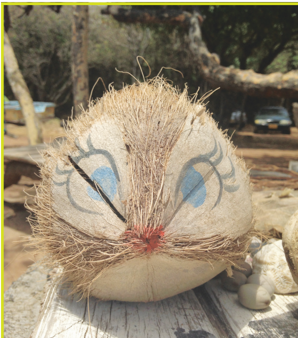
Figure 5: Caribbean culture is intimately tied to the natural environment.

There is already consensus for a transition to green economies by almost all OECS member governments and a few public and private stakeholders to address the continuing environmental degradation, general economic and social malaise and the high vulnerabilities to natural disasters in the sub-region. However, most definitions of green economy are quite narrow with almost no consideration of equity and inclusion. In addition, the role of micro, small and medium enterprises (MSMEs) and informal entrepreneurs are generally not factored into the official approaches. There is also little or no uptake of