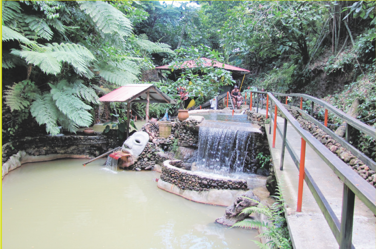
Figure 12: Dominica's natural hot springs are an attraction for locals and visitors alike and support local green enterprises.