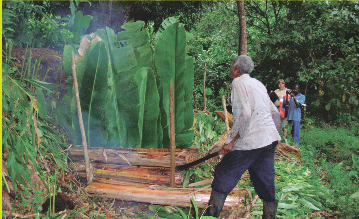
Figure 8: Many OECS livelihoods, like charcoal production in Saint Lucia, are based on the sustainable use of natural resources.

succeed in transforming their economies into ones that are pro-poor, climate resilient, socially inclusive, economically vibrant and sustainable. As such, a Green/Blue Economy Strategy and Action Plan for the OECS should be developed to define key principles, objectives, policy needs, pathways and capacity needs for economic transformation considering OECS members' own unique contexts.