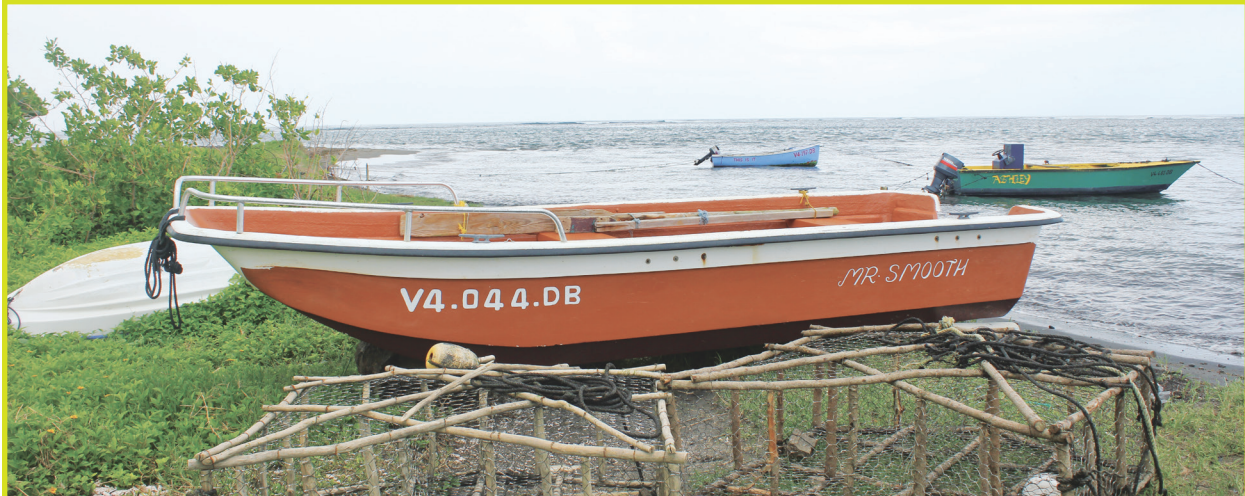
Figure 4: Small scale fisheries in St. Kitts and Nevis are important for food security and livelihoods.

economic and social development pathway that is based on environmentally friendly values and strategies that support sustainable livelihood activities and socio-economic development at community, countrywide and regional levels.