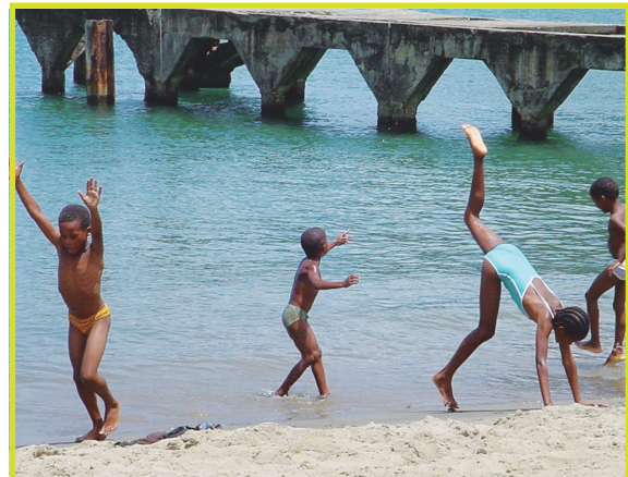
Figure 1: Economic development must be environmentally sustainable and provide opportunities for Caribbean people.