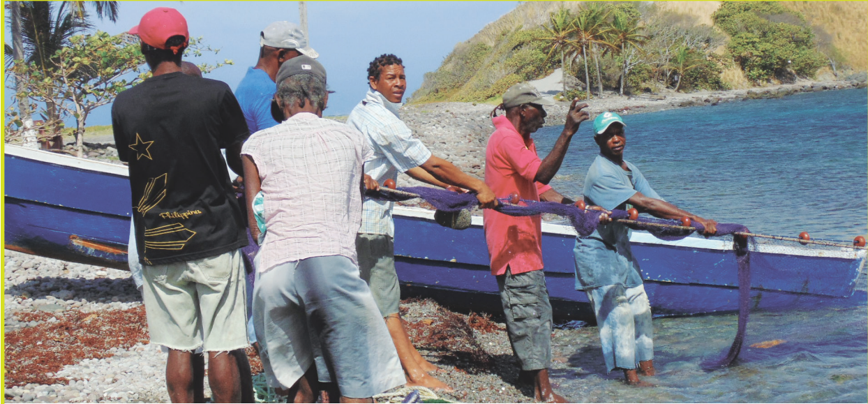
Figure 13: The people of the OECS, like these fishers in Dominica, must be at the centre of economic transformation.