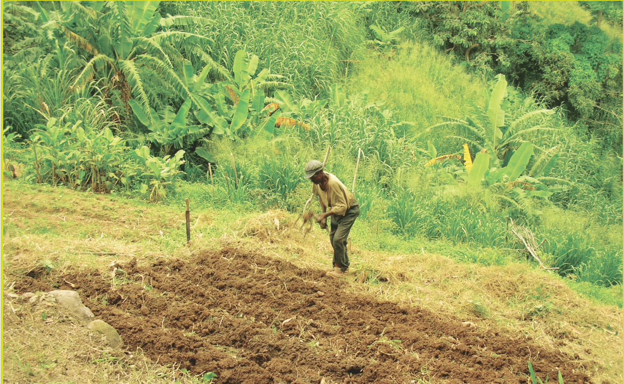
Figure 10: Valuing natural ecosystem services, like those supporting farming in the hills of Montserrat, is central to economic transformation.

would need to play a leadership role. Additionally, appropriate partnerships with investors, donors and the international community is needed to enable the transition in the sub-region.