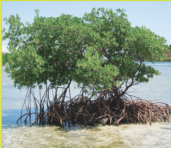
Figure 6: Most of the mangroves in the BVI were destroyed by 2017 hurricanes, leaving coastlines vulnerable.

natural capital valuation by public and private actors, which has resulted in continuing poor protection of ecosystem health and natural resources. Actions are not being led by, or necessarily mainstreamed in, finance and economic development agencies.