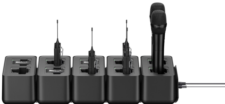
The new CHG 70N-C cascading network charge

Earlier this year, CHG 70N, a non-cascading variant of the EW -DX 2-bay network charger , began shipping to customers. Today, Sennheiser announces the replacement for CHG 70N , a network charger that can be cascaded (up to 5 x network charger units) , named CHG 70N-C.