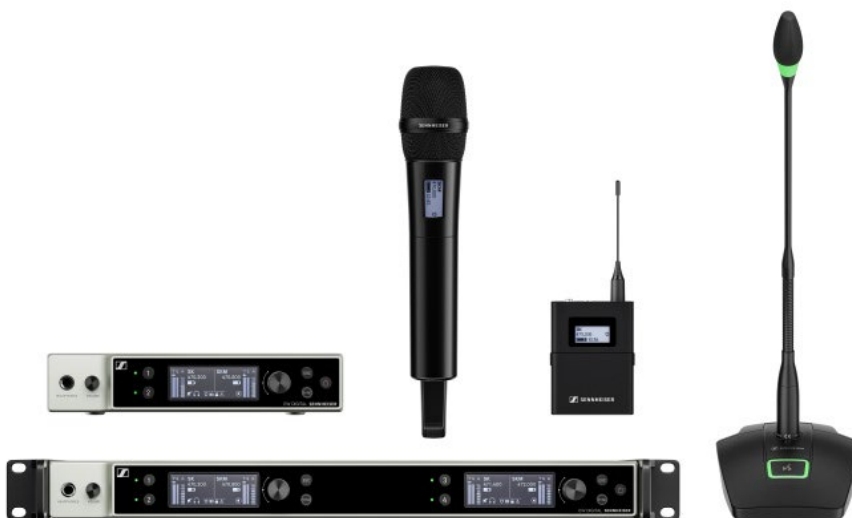
A glimpse at some of the EW-DX system components

In addition to the EW-DX TS3 and 5-pin table stand transmitters in all frequency ranges, a four-channel Dante receiver with full 19” rack size is expected to be available mid-2024.