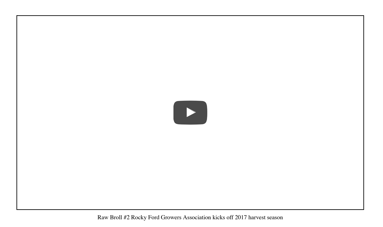
Raw Broll #3 Rocky Ford Growers Association kicks off 2017 harvest season