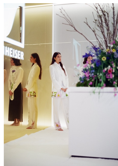
Afterpay Australian Fashion Week. #AAFW