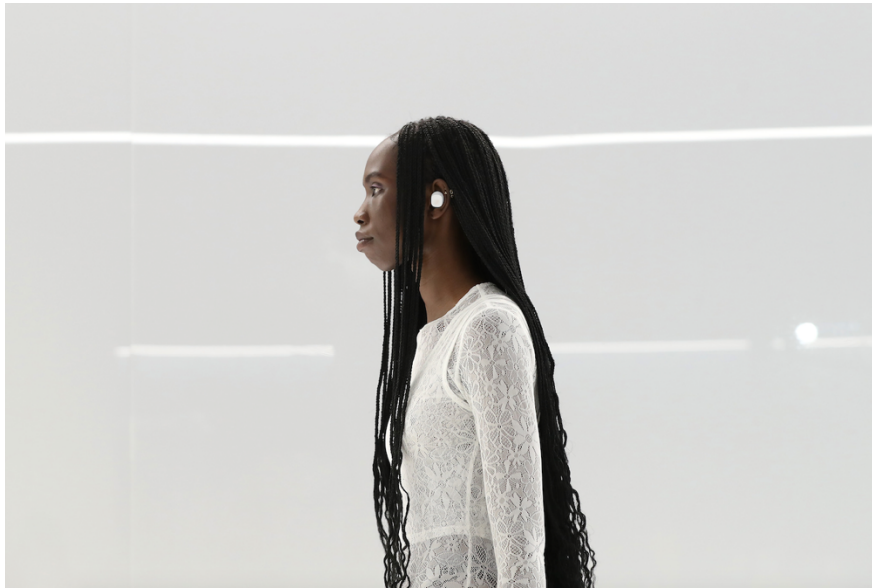
Afterpay Australian Fashion Week. #AAFW