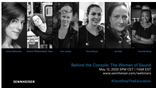
Behind the Console: Women of Sound: Meet six leading women from the pro audio and touring industry

Join leading women from the pro audio and touring industry at Sennheiser’s next round-table discussion on May 12, 17:00 CEST (15:00 UTC). #Don’tStopTheEducation