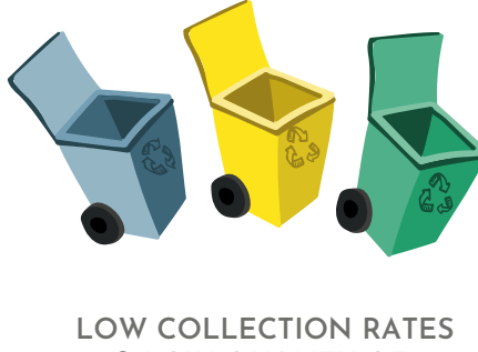
& LOW QUALITY OF INPUT MATERIALS