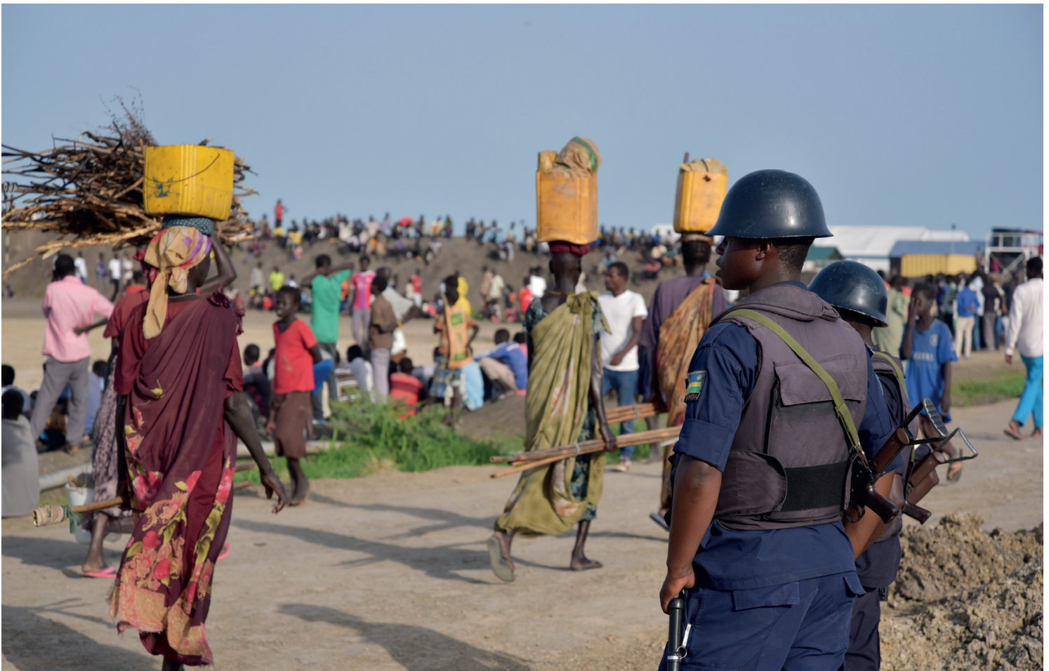
UN peacekeepers stand guard, while site residents enjoy a game of football

Findings from MSF survey in the Malakal UN Protection of Civilian site