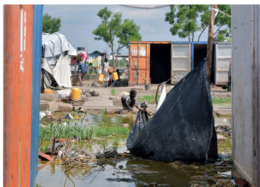
Arijun Claire © MSF