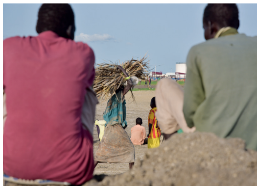
Two men look on as a woman returns to the site after collecting firewood

Since February 2016, MSF has provided 406 consultations for physical injuries associated with violence