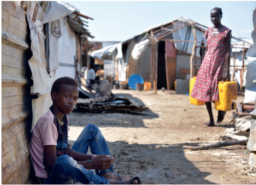
A young boy rests in the shade to take refuge from the blistering sun

Confidence in the commitment of UN peacekeepers to protect was low. Recent measures to secure the main UN compound with sand bags have added to the distrust of people, as one interviewee put it, "now the UN is building sand barriers to secure its area. Let them also do it around the whole PoC. Now if something like February happens, IDPs will not be able to get inside".