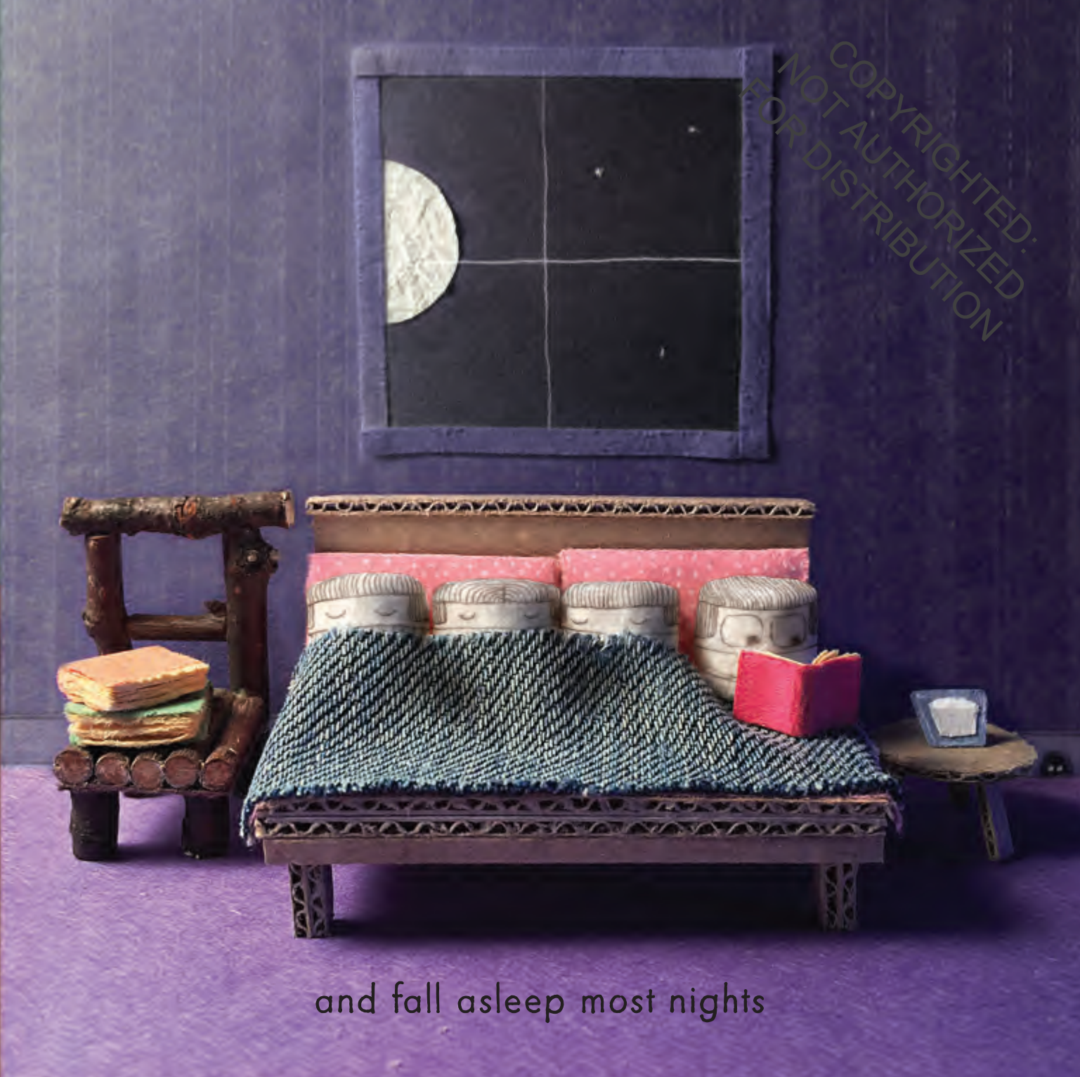
and fall asleep most nights