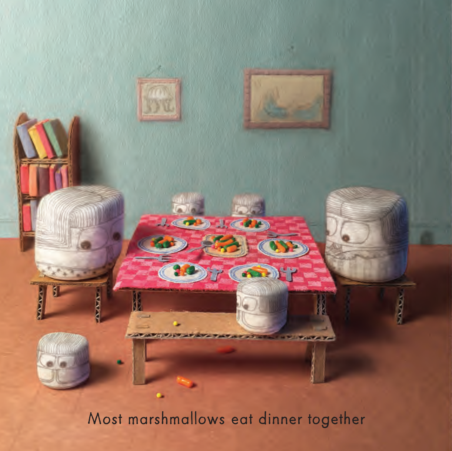
Most marshmallows eat dinner together