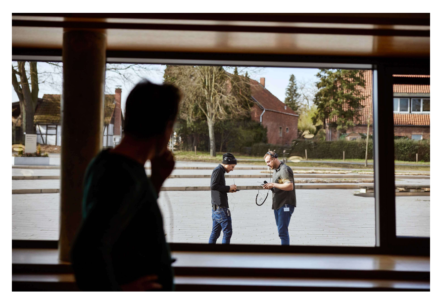
Walk test in progress