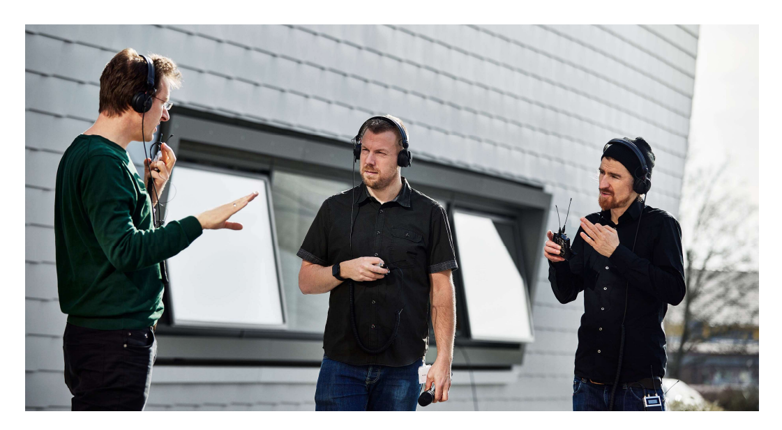
Langaton monikanavainen äänentoistojärjestelmä – teknologiatesti

Taajuuskoordinoinnin asiantuntijat testasivat teknologian toimivuutta kapea- ja laajakaistaisten järjestelmien rinnakkaiskäytössä